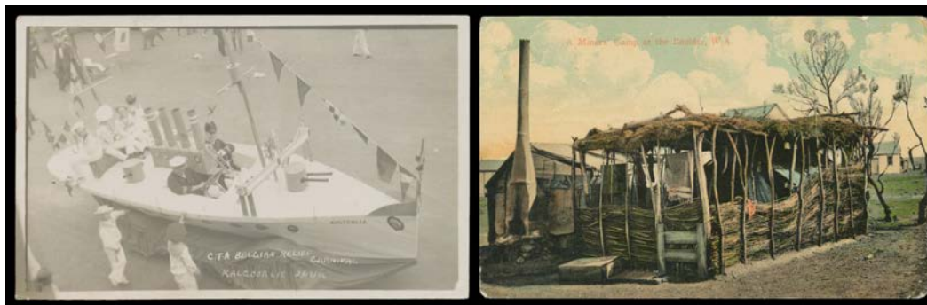
Ex Lot 455