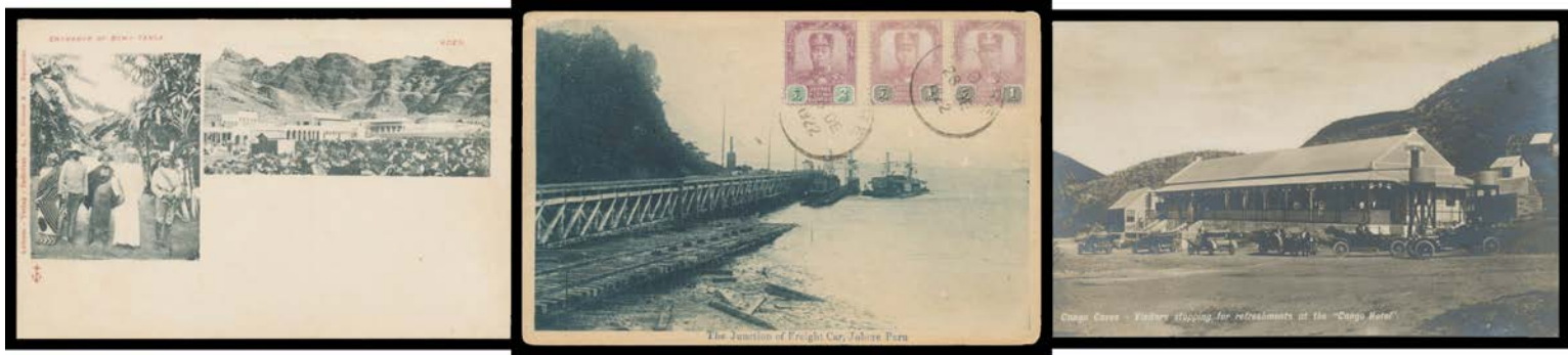
Ex Lot 50