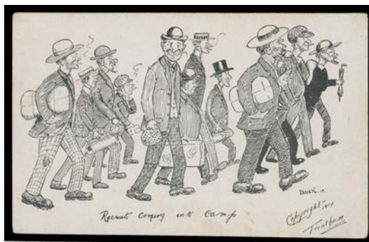
Ex Lot 734