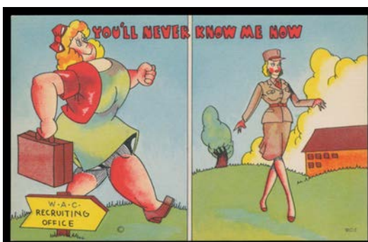
Ex Lot 155