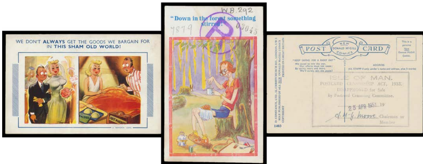
Ex Lot 192