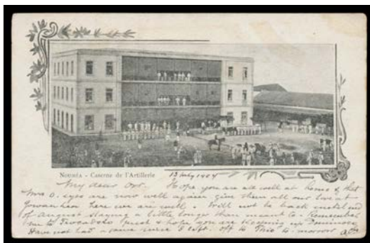
Ex Lot 522

522 C A-/B NEW CALEDONIA: 1903-07 selection "Caserne de l'Artillerie", "Canaques travaillant sur une pirogue", three whites at a creek & Tahiti 1906 "Raiatea Avant la pacification" & "Indigène de Papeete", three with Commerce & two with Kagu frankings, two each from 'NOUMEA' & 'THIO', also Polynesia 1925 "Sunset on Moorea" with 1fr, all to various Sydney addresses, good to fine. (6)