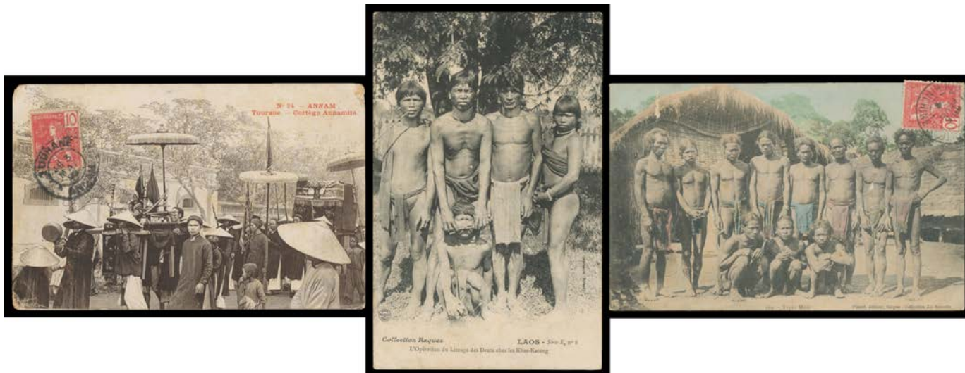
Ex Lot 519

519 C - Bundle with views etc of Annam x17 including several real photo types, Tonkin x3, Cambodia x3 and Laos, etc, mostly postally used including at least twenty to Australia and with good postmark content including mailboat sorters, condition varied but generally fine to very fine. (35)