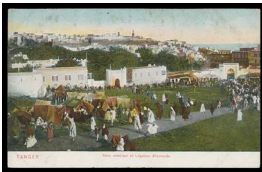
Ex Lot 520

520 C MOROCCO: Large packet mostly of Casablanca, Fez & Rabat including a few Undivided Backs, a quality group of real photo types & attractive artist cards, some ethnic subjects, several cards with Spanish backs but French captions, some postal history/postmark interest, also five packets of 10 or 20 CAP perforated cards of Tangier x4 or Rabat, condition variable but generally fine to very fine. Ex Keith Harrison. (160+)