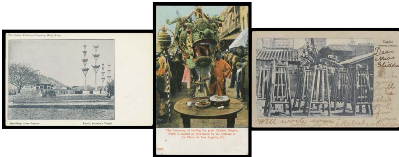
Ex Lot 487

487 C Fascinating group featuring ghastly punishments including torture, executions - one a real photo of decapitated bodies - including "Linchi: cutting into pieces" (!), funeral processions, graves, an opium den, "The Ceremony of feeding the great Chinese Dragon" etc, some are Hong Kong or Macau cards, condition generally fine to very fine. Ex Bronte Watts. (32)