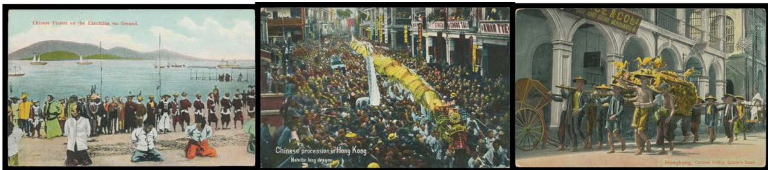
Ex Lot 674

674 C Group mostly by local producers Hong Kong Pictorial Postcard Co, Graeco Egyptian Tobacco Store, Turco-Egyptian Tobacco Store x2, C Fiens, M Steinberg, MA & Co, Lau Ping Kee x7, Yee Wo Shing x3 , also sepia views 'Made in Japan' x5, good range of subjects including punishments, street vendors, "Filter beds, Bowen Road", panoramic views, Chinese festival, Chinese coffin etc, generally fine to very fine, all but one unused. (23)