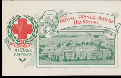
Ex Lot 294