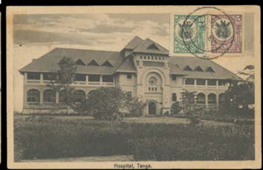
Ex Lot 147