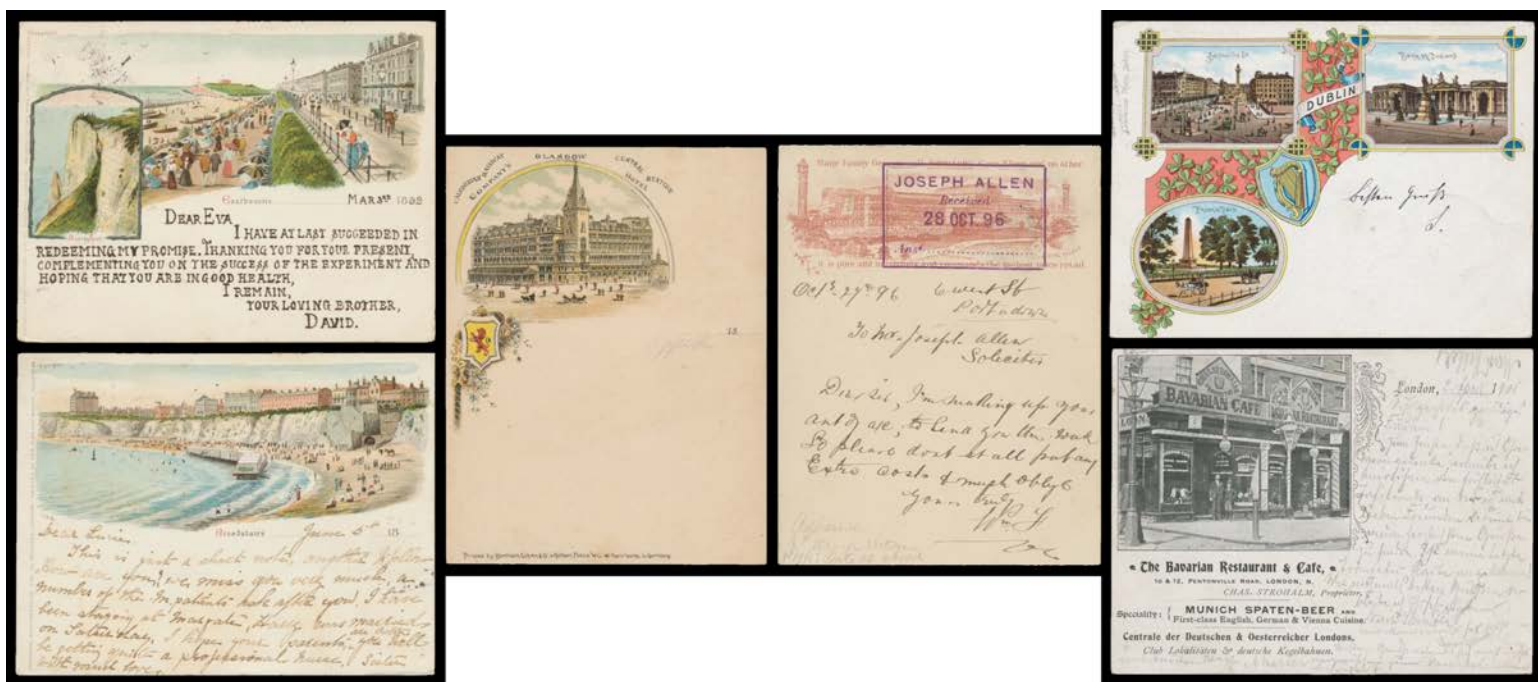
Ex Lot 593