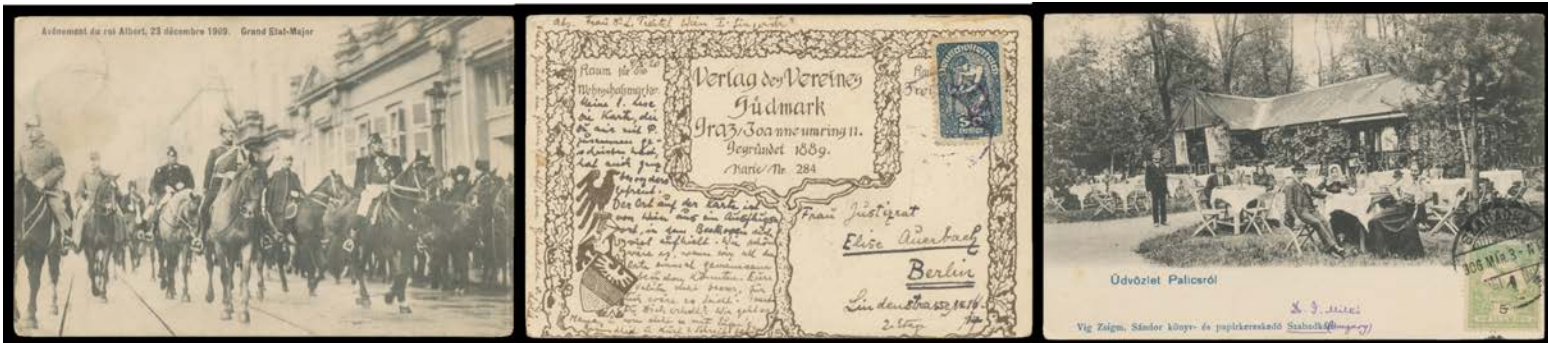
Ex Lot 33

24 C European selections from Belgium x14 & Belgian Congo x3; Finland x8; Greece x25 including Greek Islands & Salonika Fires on 18/8/1917; Italy x32 including Volcanic Eruptions of Vesuvius in 1906 & Etna in 1928; Italian Colonies Eritrea x6 & Libya x8; Holland x9 including Windmill Watercolours set of 6; & a couple of others; mostly unused but some postmark interest, condition variable but generally fine to very fine. Ex Keith Harrison. (105) 240 T