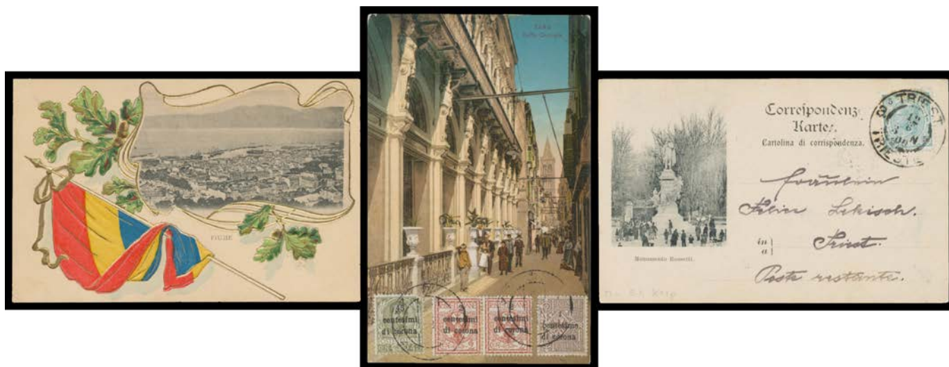
Ex Lot 681

681 C FIUME & TRIESTE: Attractive Fiume group including Undivided Backs x6 (one with Austrian stamp & 'GRUZ/GRAVOSA' cds & two with Hungarian stamps & 'FIUME' cds), two with embossed Flags, etc; Trieste Undivided Back with Domenico Rossetti illustrations on both sides with Austrian stamp & 'TRIEST/ A /TRIESTE' cds, and 1911 busy scene at Grado with Austrian stamp & 'GRADO' cds, one other; and Zara street scene & Dalmatia Costumes x3 all unused but with Zara Overprints on the views; generally fine to very fine. Very scarce group reflecting the fascinating political history of this area. Ex Keith Harrison. (20)