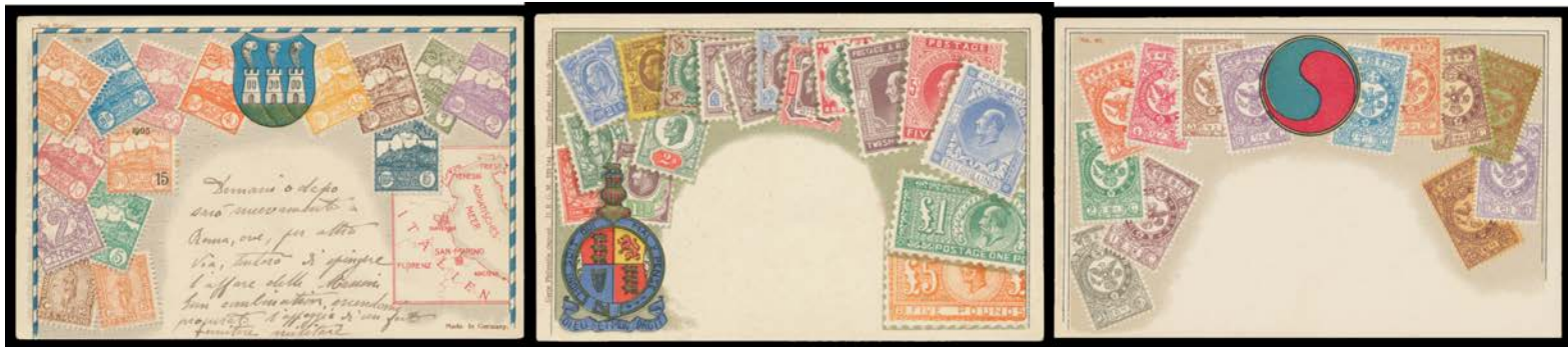
Ex Lot 230

230 C STAMP CARDS: Comprehensive collection of Ottmar Zieher cards for most of the countries of the world at that time, some apparent duplication but that's because of inclusion of both embossed & flat-plate versions, many also with Coats of Arms & some with Maps Added, mostly unused but we noted San Marino used in San Marino!, condition rather mixed but many are fine to very fine & a few are superb. Ex Derek Pocock. [Spot the error on the British card] (103)