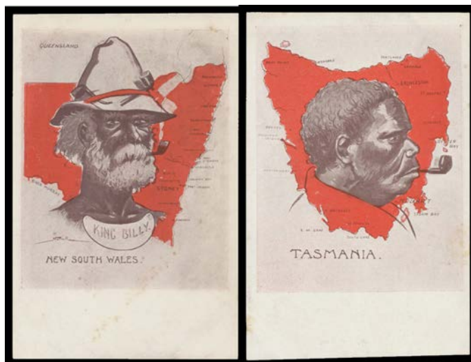
Ex Lot 258

258 C A/A- ABORIGINES: VSM Series of Aboriginal "types" from each State by James Charles Nuttall in shades of red & purple, a few minor blemishes, unused. A rare early set. (6)