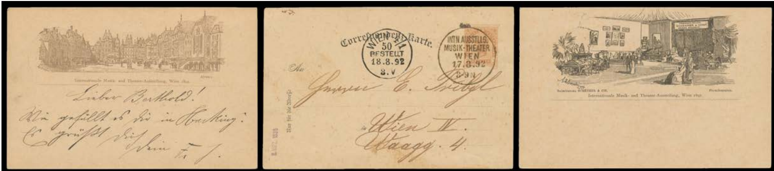
Ex Lot 468

468 PS A/B 1892 2kr Postal Cards with five different illustrations for the Internationale Musik- und Theater-Ausstellung in black or shades of brown on the message-side, each with very fine to superb strike of the 'INTN AUSSTLLG/ MUSIK-THEATER/WIEN/27.7.92' commemorative datestamp & two with a Wien arrival cds, also one of the views unused, some minor blemishes. Ex Keith Harrison. (6)