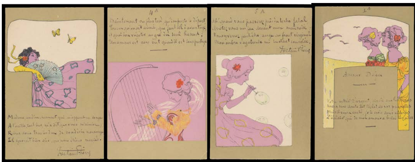
Ex Lot 85

85 C B - Flowers in the Hair Series set (?) of 9 with Undivided Backs, light damp spotting on the address side, all locally used at 'ISMAILIA' (Egypt) in 1900. Ex Keith Harrison. (9)