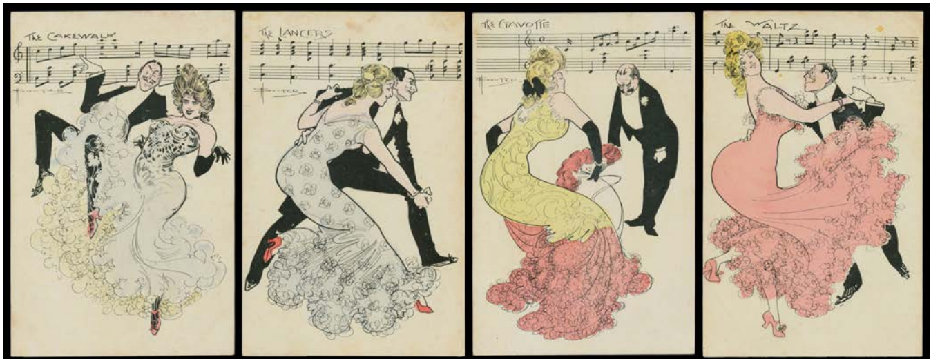
Ex Lot 282