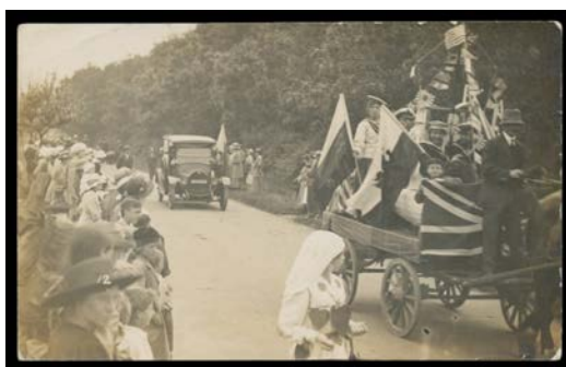
Ex Lot 646