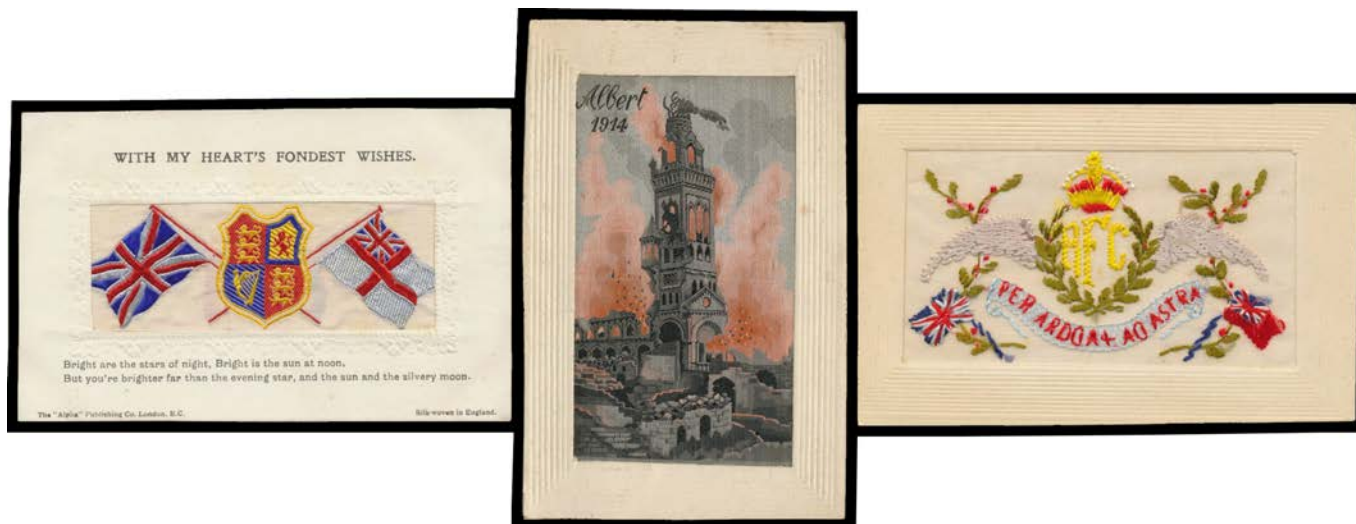
Ex Lot 645

645 C PATRIOTIC: A surprisingly high quality selection of World War I "Silks" with all manner of Flags, Bunting & Patriotic Messages including "Gone/But/Not Forgotten" with inset photograph of Lord Kitchener , plus a few Regimental types & some with the original enclosed greeting cards (plus 16 more loose insert cards), includes Alpha Publishing Co x2 & two French types of Fire Damage in "Albert 1914" & "Frise (Somme) 1916", also a couple from early in World War II (not previously seen by us), some used under cover otherwise unused. Ex Keith Harrison . [These delicate items are often badly aged/discooured. This group are among the finest examples we have seen] (47 + inserts)