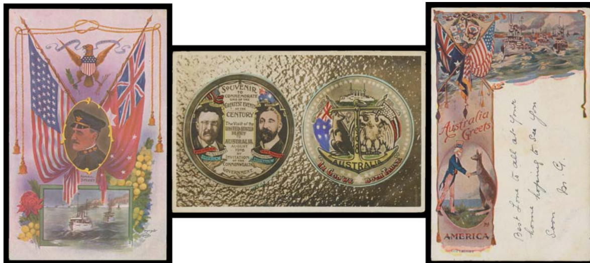
Ex Lot 251