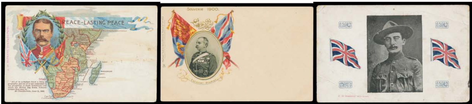
Ex Lot 163

154 C A-/B HUMOUR: British World War I postcards with original patriotic cartoons by Fred Gothard , all initialled "FG" & with 'Original Sketch by FG' handstamp on the address sides, a little aged. (6) 150