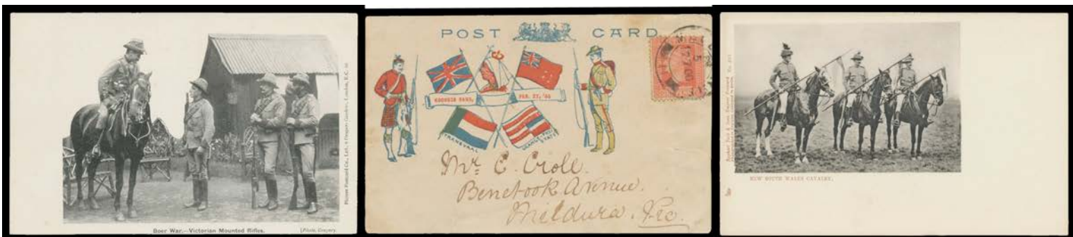
Ex Lot 299