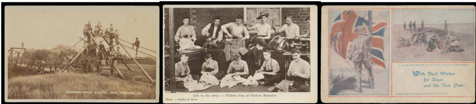
Ex Lot 638

638 C MILITARY WORLD WAR I: Wide-ranging collection with many real photo types including Army Camps notably at Bordon x21, Royal Engineers x3 & several multi-view types, "Life in the Army" x2, Kitchener & other Generals plus Indian Princes who Supported the War Effort, etc, others with several Tuck's Tanks & Aircraft and artist cards including "Daring Deeds" set of 6, Women of the Bombay Presidency Mesopotamia card (faults), etc, plus Patriotics with lots of flags & patriotic statements, Nursing including Tito Corbella artist cards for Death of Edith Cavell set of 6, "The Mother's Dream - and the Victoria Cross", unattributed artist cards set of 6 from "Leaving Home..." to "The VC - A Proud Moment", etc, condition variable but generally fine to very fine. Ex Keith Harrison.(120 approx)