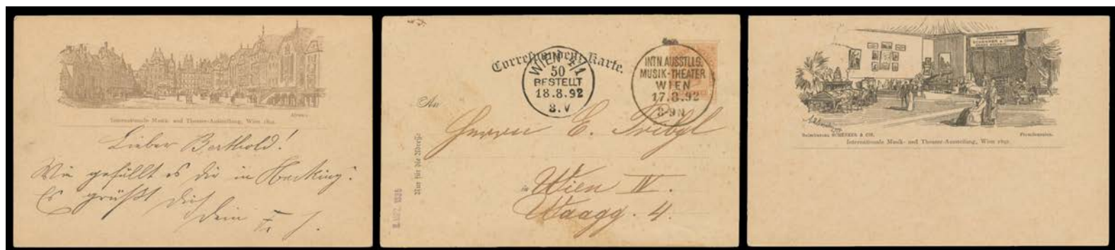
Ex Lot 468