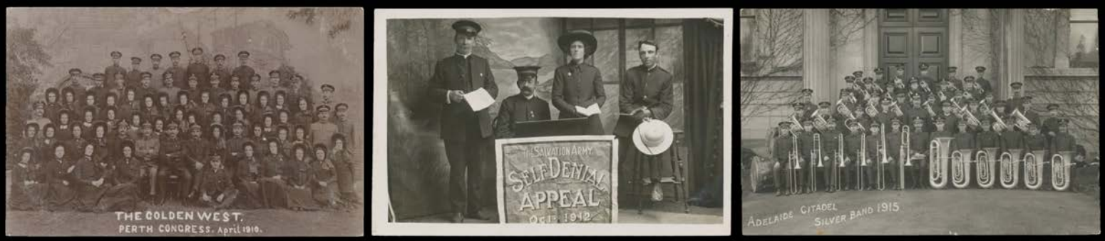
Ex Lot 309

309 C A/B SALVATION ARMY: Mostly South Australian group including studio portraits, "General Booth on Tour", etc, real photo types including "Self-Denial Appeal Oct 1912", "Adelaide Citadel Silver Band 1915" & "The Golden West Perth Congress April 1910", fine to very fine. Ex Bronte Watts. [See also Lot 197] (13)