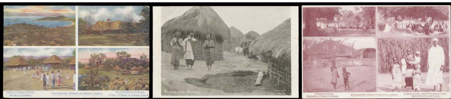
Ex Lot 749

749 C Universities Mission to Central Africa cards with black & white photos x11, black & white "linocuts" x4, coloured artist cards x26 & others x7, a few are duplicates, two are captioned "Zanzibar", generally fine to very fine unused or used. Ex Derek Pocock.(48) 400