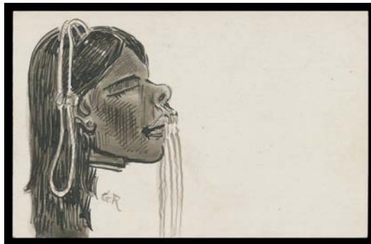
Ex Lot 739

739 C A MAORI: original drawing on a postcard of a female mokomokai by HG Robley & initialled "GR", unused. Unique & culturally important. [Robley became an avid student of Maori culture & acquired the extraordinary number of 35 mokomokai (the heads of heavily tattooed Maori - moko - that were severed after death & treated for preservation). Also an original drawing of a Tiki & other artefacts on a postcard, probably by Robley but not initialled or signed] (2) 500