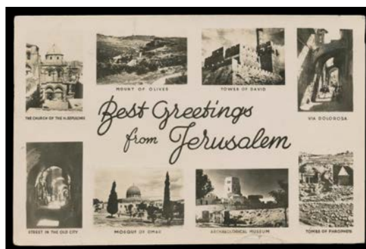
Ex Lot 669

669 C Bundle with English captions including Halladjian types with Undivided Backs x8, real photo Undivided Back of "Jews wailing place", also Oriental Commercial Bureau types x6, CA & Co artist cards x6, Scripture Gift Mission artist cards x2, WWI "In Jerusalem: Indian Lancers passing through the streets" etc, generally fine to very fine and mostly unused. (38)