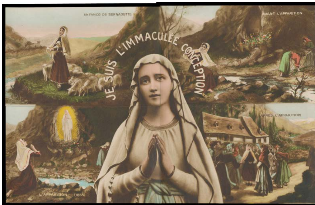
Ex Lot 504

504 C "Instalment Cards" sets of 10 comprising "Corrida de Toros" (Bull Fighting), WWI "Infanterie Coloniale" (a few mostly minor faults), "Je Suis L'imaculée Conception" & a 'bas relief' of Napoleon, also "Napoléon" colour photos set of 12 & "Cathédrale d'Amiens" set of 20, generally very fine to superb unused. Ex Keith Harrison. [Basically simple jigsaw puzzles; placed in order, the individual cards create a larger picture. See also Lots 181, 461 & 609] (72) 500 T