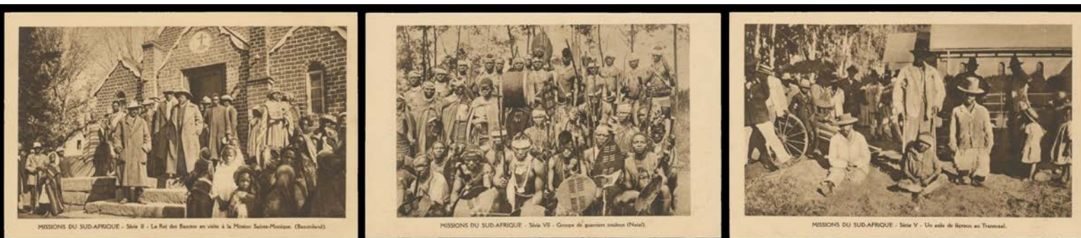
Ex Lot 780

780 C B/A+ MISSIONARIES: French Catholic Missionnaires Oblats de Marie-Immaculée (Missions du Sud-Afrique) complete set of sepia/cream cards with captions for Natal, Transvaal and Zululand but the majority for Basutoland , many terrific subjects including Basutos on Horseback, the Bassuto King at Church, Group of Lepers, Missionaries Roughing It, Boys' Gymnasium Class, Zulu Warriors, Women Building Huts, etc, a few problems noted but generally fine to superb, apparently all unused. A marvellous lot: see also Lots 483 & 485. Ex Derek Pocock. [With a list of the nine sets of 10 cards] (90) 750