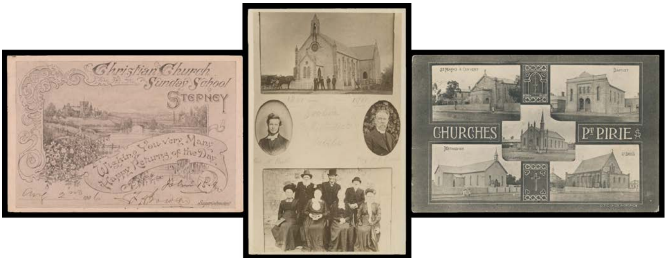
Ex Lot 379

379 C CHURCHES: Mounted group with St Peter's Cathedral North Adelaide x8, many other fine structures but also many small churches including real photo type of the weatherboard building at Rosewater, multi-views of "Church of Christ Grote St" & "Churches of Pt Pirie", real photo commemoratives "Bethany Church Jubilee 1833-1933" & "1861-1911 Goolwa Methodist Jubilee", etc, generally fine to very fine. Ex Bronte Watts. (64)