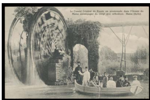
Ex Lot 668

668 C Packet of better views and subjects with captions in French x15 including chromolitho "Souvenir de Jerusalem", "Bethlehem: Le Jour de Noel", two Syrian cards re return of the Orthodox Archbishop from Russia, washing of the feet in Jerusalem, women at the Wailing Wall etc, plus with captions in German x4 and two real photo types, generally fine to very fine unused. (21)