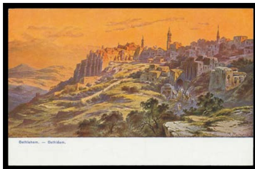
Ex Lot 667

667 C Beautiful group including CA & Co illustrations x31, another series of coloured views without publisher x12, a couple of real photo types etc, mostly unused & generally fine to very fine; also three Israeli covers including Tabul Miniature Sheet on unaddressed First Day Cover. (54 items)