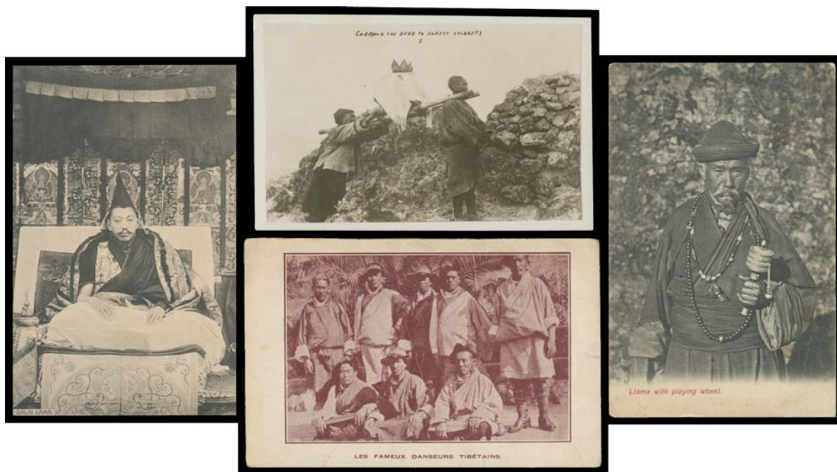
Ex Lot 491

491 C TIBET: Real photo types "Mount Everest...from Rongbuk Monastery", "Tibetan Dance at Hotel Mount Everest", "Hindu Temple, Manora" & "Carrying the Dead to Forest (Tibbet)" [ sic ], Phototype Co (Bombay) "Llama with playing [ sic ] wheel" (should be "praying" wheel), Theodore Paar (Darjeeling) "Tibetan Man", "Wheel of Existence" (superb) & "Dalai Lama" (superb), artist cards "City of Lhassa, Thibet [ sic ], Mysterious Home of the Dalai Lama" (plain back) & "...Mode of Worshipping", and French 1925 Exposition des Arts Décoratifs "Les Fameux Danseurs Tibétains" (minor faults), a few problems but generally fine to superb unused. Very elusive material. Ex Keith Harrison.(11) 400 T