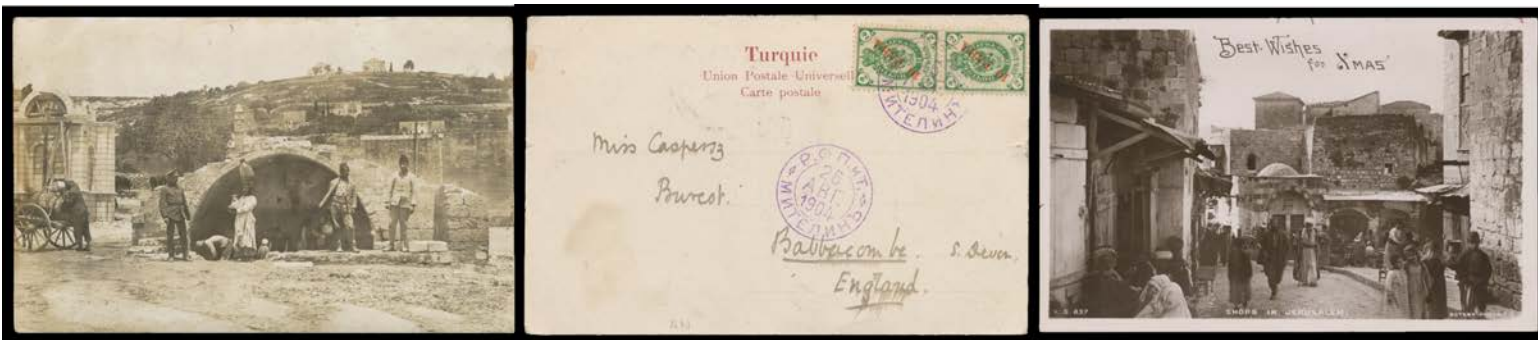
Ex Lot 672