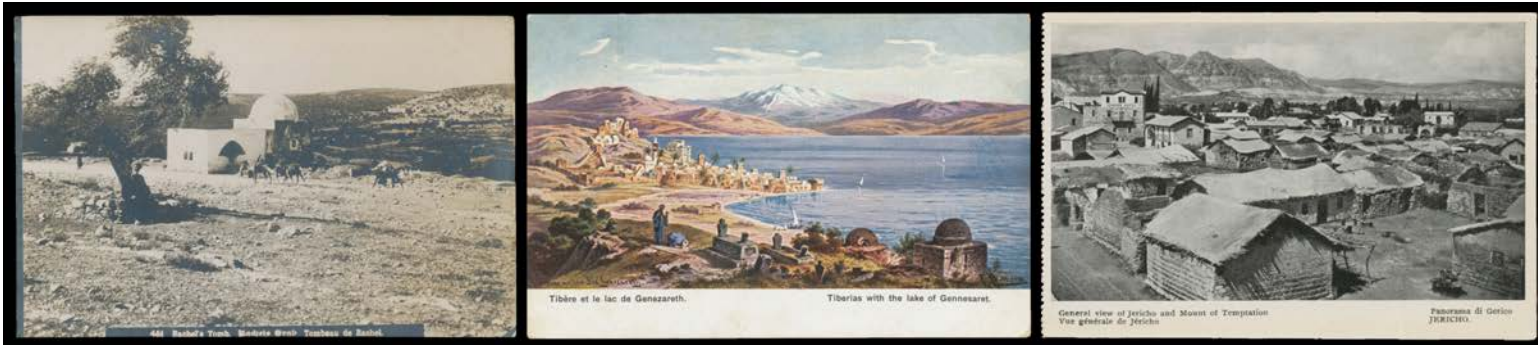
Ex Lot 671

671 C Large album with a strong range of Attallah Freres (Jerusalem) cards perforated at left, artist cards, real photo types, some post-WWII Israeli coloured cards with English/Hebrew inscriptions, also a smattering of non-Palestine cards, mostly unused & generally very fine. Ex Aldo Paladin. (200 approx)