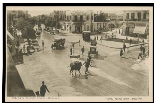
Ex Lot 670

670 C Captions in English and Hebrew from Eliahu Brothers black & white x20, mostly of Tel Aviv, plus five coloured types, very fine, unused. (25)