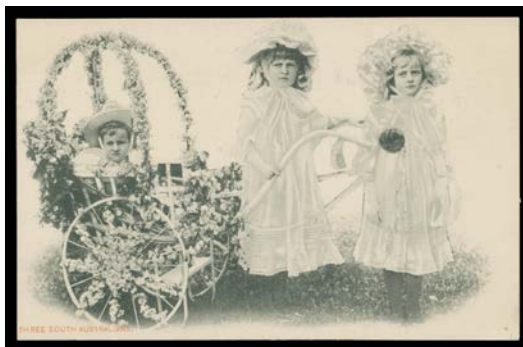
Ex Lot 104