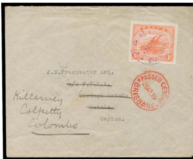
Ex Lot 1387