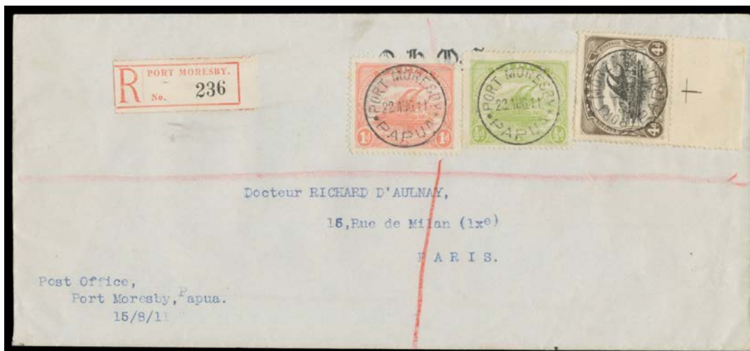
Ex Lot 1383