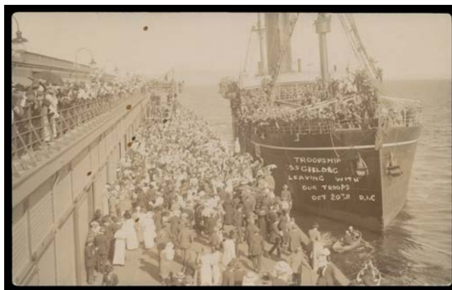
Ex Lot 794