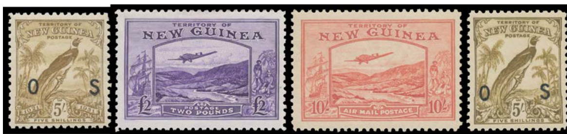
Ex Lot 1338

1338 */** A/B Selection with Huts 5/- 10/- & £1, Hut Airs to 5/-, Undated Birds 5/- pair 10/- & £1 plus Unissued 1/2d (unusually fine), Undated Airs 10/- & £1, 1935 Bulolo £2, 1939 Bulolo set plus extra 10/- & £1 x2, Dated 'OS' set & Undated 'OS' 5/-, etc, some minor oxidation & gum aging but generally very fine, most of those mentioned are very lightly mounted or unmounted, Cat £3300+ (mounted). (65)