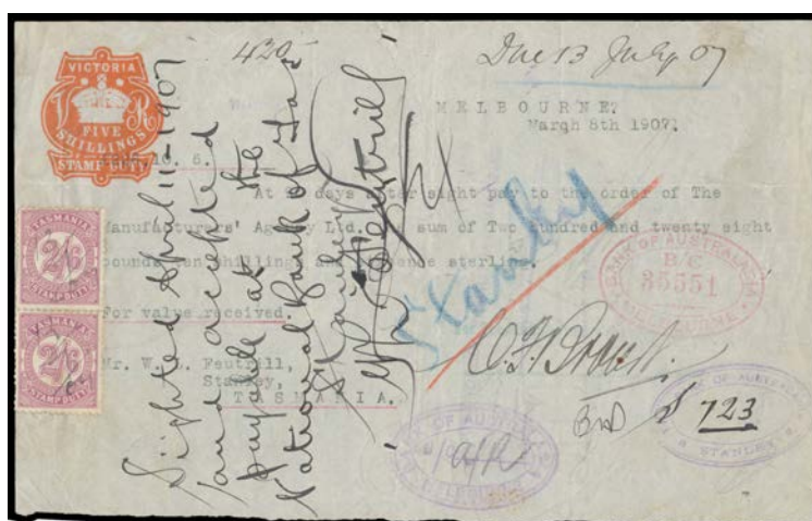
Ex Lot 827

827 $ Pre-WWI financial instruments virtually all from Tasmanian firms including illustrated types & others with elaborate engraved features, with a good variety of revenues including embossed Platypus types, mostly negotiated in Victoria with further revenues including embossed types, several with "collection" slips affixed, condition variable but generally fine to very fine. A very attractive & desirable collection. (118)