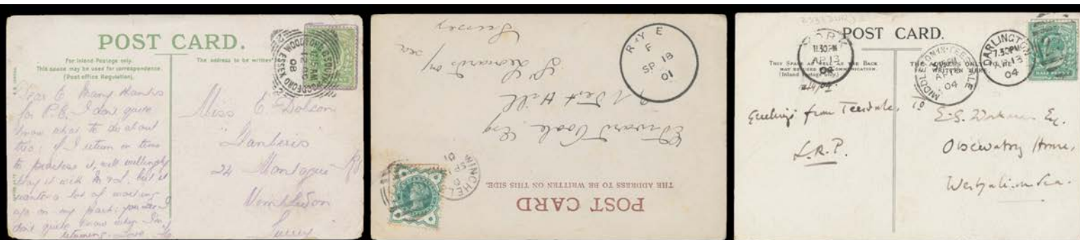
Ex Lot 1244

1244 C POSTMARKS: Three volumes of PPCs all selected for the postmarks with two volumes of mostly duplex cancellations & one volume of squared-circle datestamps plus a selection of Mobile Boite dock-side usages, numerous very fine to superb strikes, many cards are used from the towns depicted, many better cards with some Undivided Backs including one with photo affixed to the view-side, many towns & villages, smaller churches, Cornwall & Wales, etc, advertising cards for P&O x2, "The Great Anglican Gathering" & Booth Line of Royal Mail Steamers , a few humour including a marvellous Cycling Accident by "Cynicus" & one with a circular message, condition variable. An excellent lot especially for the possibility of finding Earliest Recorded Usages. (100s) 750