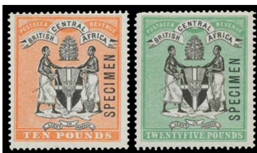
Ex Lot 1370