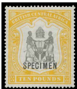
Ex Lot 1371