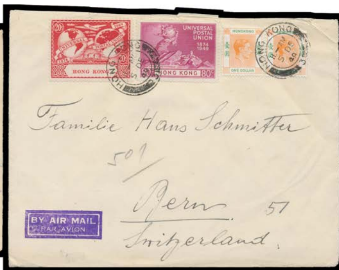
Ex Lot 531