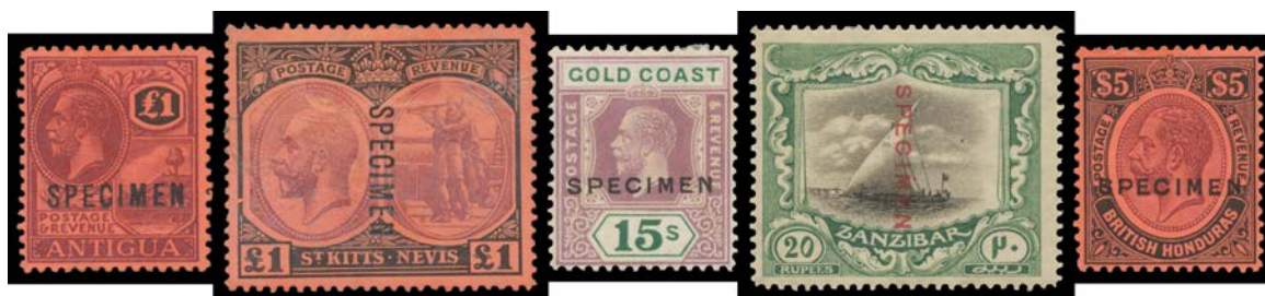
Ex Lot 514

513 CPS Mostly military/wartime covers with a few World War I including 1916 OAS from Tanganyika (?) with black/green 'OPENED UNDER MARTIAL LAW' label across the flap; World War II including Australian War Savings booklet with "Spitfire" 6d x15 affixed within, Australian POW Postcard - no camp indicated but probably in Thailand - to NSW, China 1940 uprated Postal Card to NSW, commercial airmails including 3 from 'BRITISH CONSULATE/Curacao' to USA, 1942 Guatemala-USA with 'BRITISH LEGATION/V' h/s & franking including a bisect, some parcel fragments including high value frankings from GB & Malaya; post-WWII including Austria 1953 to NSW with Costumes 40g & 10s; etc, condition variable. (140 approx) 500