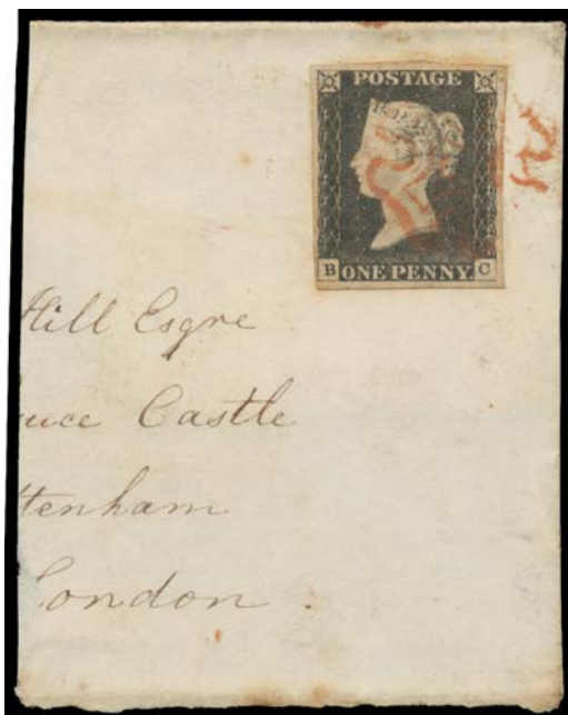
Ex Lot 507