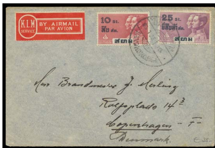
Ex Lot 512