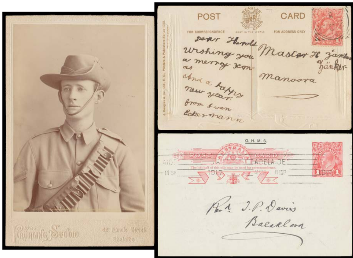
Ex Lot 526