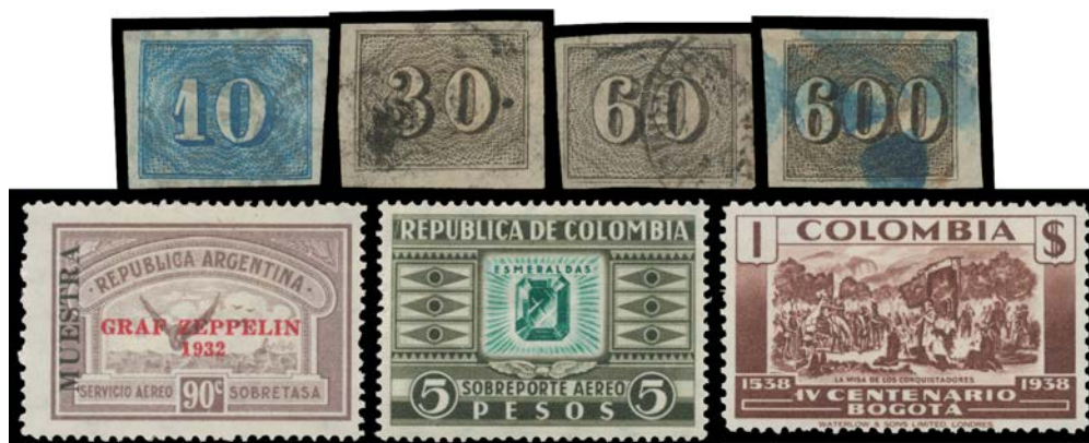
Ex Lot 517

516 **OC A real mixed bag with Colombia revenues to $20 with small puncture & 'SPECIMEN' Overprint (15 + 6 blocks of 4); 'BECHUANALAND/PROTECTORATE' KEVII Revenues 2/6d with postal cds; a very scrappy group of pre-1901 South African covers including internal & registered items from Transvaal; 1936 much-travelled cover from USA to Egypt & beyond; & a few others. 150