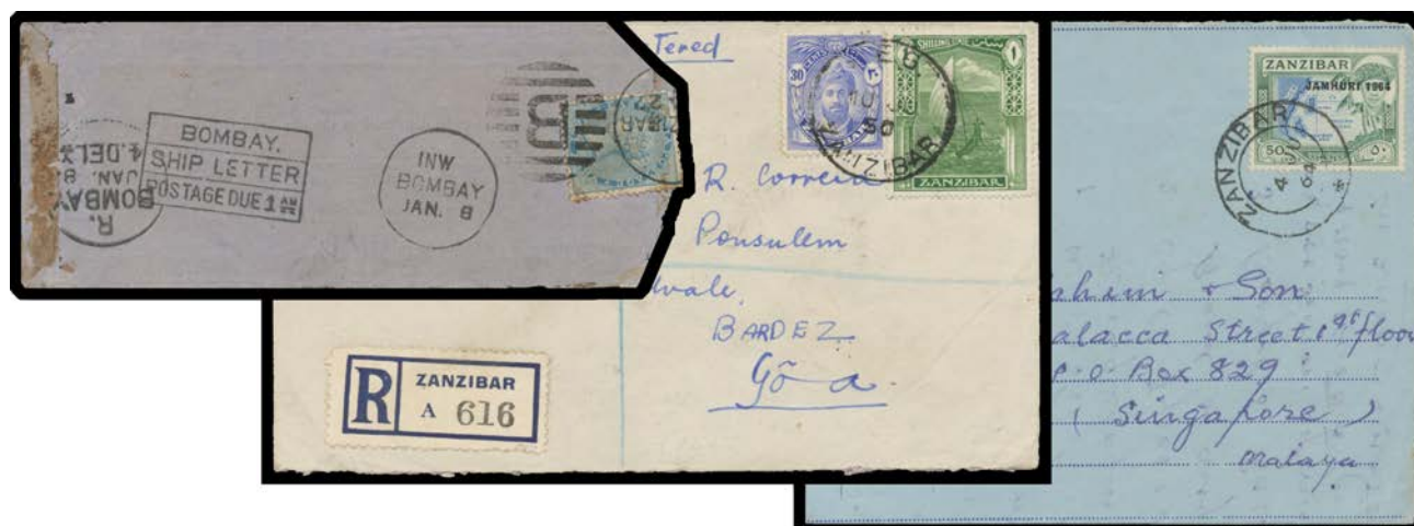
Ex Lot 1433

1433 CPS Commercial mail including 1880s tiny cover with East India ½a tied to the reverse by large-part 'ZANZIBAR - B' duplex, superb boxed 'BOMBAY/SHIP LETTER/POSTAGE DUE 1AN' h/s, 1894 Richter & Co cover to Germany - one stamp missing - with 'LIGNE N/PAQ FR No 8' d/s, 1905 Zanzibar PPC to Nova Scotia, 1907 inwards Indian Envelope with Zanzibar cancels & boxed 'PAQUEBOT' h/s, 1912 PPC to Germany with boxed 'TOO LATE' h/s, 1923 trader's cover to Madagascar, 1936 airmail to Italy, 1946-50 registered airmails to Holland x2 or Goa, 1955 local covers with different 'CHAKE CHAKE' cds, 1963-65 formular aerogrammes to Singapore x3 (one with 'JAMHURI 1964' Handstamp on 50c) or Argentina, etc, condition variable. A good lot. (28)