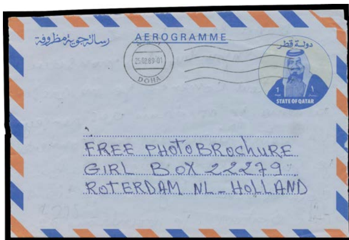
Ex Lot 1324

1324 PS A(B) QATAR: 1970-89 commercial usages of Aerogrammes 25f (repaired) with scarce '.../MIRQAAB' cds, 50d to India, 60d with Refinery & Agriculture on the Back to Bangla Desh & 1r with GPO on the Back to Holland. Scarce quartet. (4)