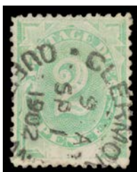
Ex Lot 695