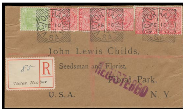
Ex Lot 718

718 C A/B 1901-18 commercial covers to the United States including 1901 Boer War patriotic cover, 1905 registered with SA ½d 2d & 3d, 1913 with superb 'VICTOR HARBOR/SA' squared-circles & small 'Victor Harbor' h/s on large registration label, 1915 double-rate with KGV 1d red & 4d orange, 1918 two underpaid to screen actress Mary Pickford but the fines apparently not collected, Nov 1918 taxed for unpaid War Tax, 1920 with War Tax paid, etc, several other WWI covers with various censor handstamps, generally fine to very fine. (14)