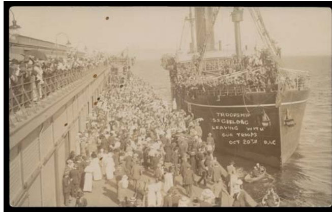
Ex Lot 794