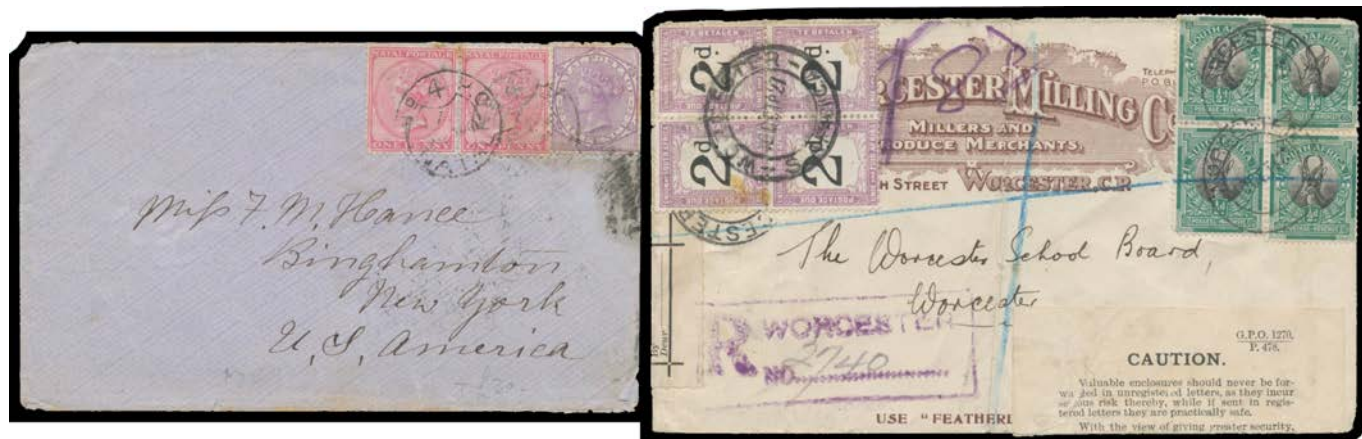
Ex Lot 1420