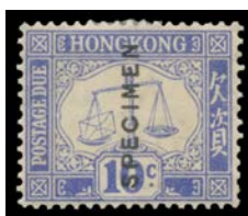
Ex Lot 1253

1253 * A B1 POSTAGE DUES: 1923 1c to 10c SG D1-5 complete with 'SPECIMEN' Overprint, Cat £425. (5)