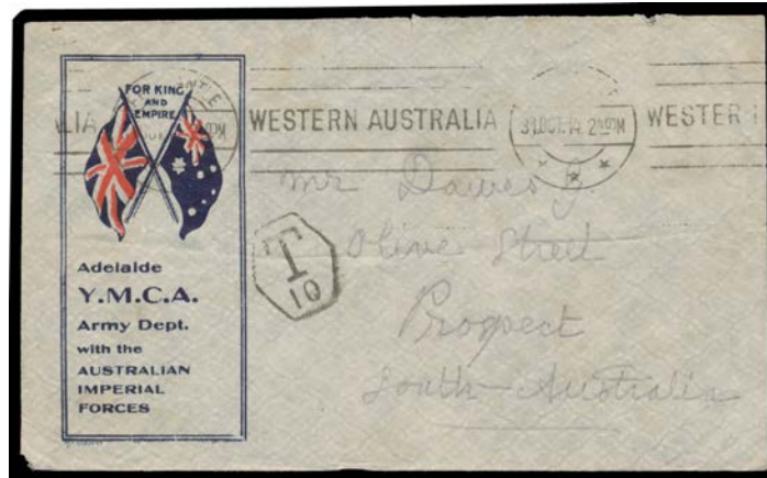
Ex Lot 788