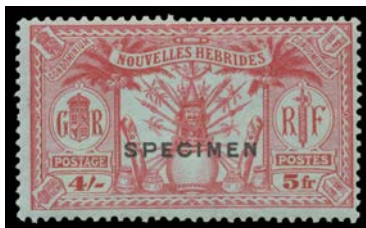
Ex Lot 1349

1349 * A B1 FRENCH: 1925 Dual Currency Arms 5c (½d) to 5fr (4/-) SG 42-52 plus the Postage Due set SG FD53-57 all with 'SPECIMEN' Overprint, Cat £500. (16) 350