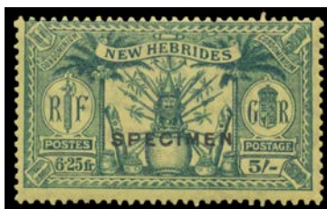
Ex Lot 1347

1347 * A B1 1925 Dual Currency Arms ½d (5c) to 5/- (4fr25c) SG 43-51 plus the Postage Due set SG D1-5 all with 'SPECIMEN' Overprint, Cat £400. (14)