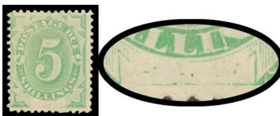
Ex Lot 694