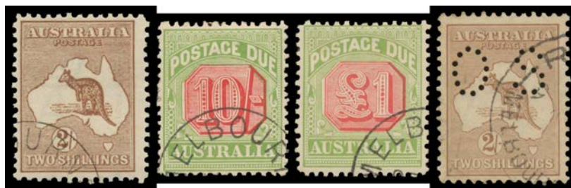
Ex Lot 536