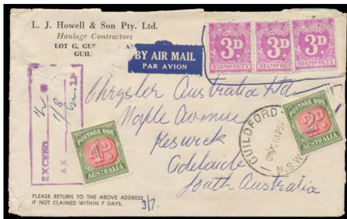
Ex Lot 713

713 C/CO Selection of taxed mail with a few pre-WWII items, 1957 irregular usage with Revenues, several Business Reply Paid cards with values to 2/- including a 1/- block of 4 (damaged), etc, condition variable. (28 items)