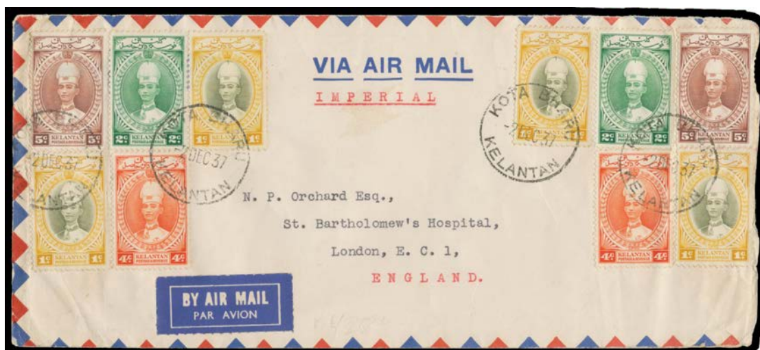
Ex Lot 1278