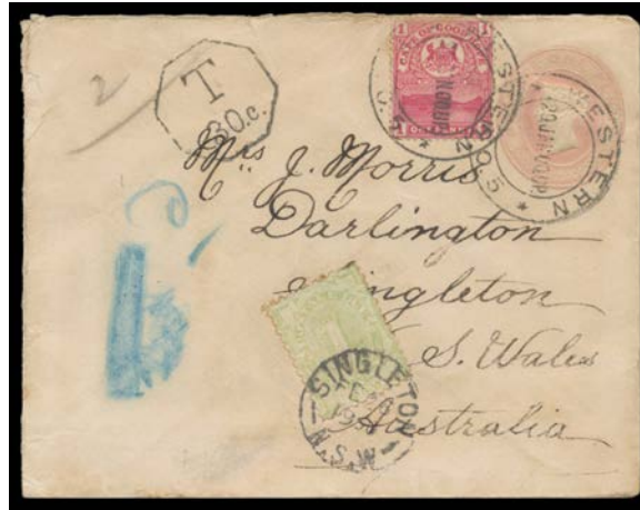
Ex Lot 1418

1418 PS CAPE OF GOOD HOPE: Commercially used mostly QV Postal Stationery comprising QV Postal Cards x3 from 'BEDFORD', 'KLOOF STREET/GARDENS', or 'SNEEZEWOOD' (seriously!) to 'UMZIMKULU'; Letter Cards x2 one underpaid to Germany with 'MAFEKING/OC13/00/CGH' squared-circle & 'T/15c' (message a little bit too affectionate!); Envelopes x7 including with Boer War PBC of Grahamstown & Nelspoort, 1894 with '876' cancels & 'NGOZLENI' cds, 1898 with superb 'PO UPINGTON' cds & 1900 underpaid to NSW with very fine 'WESTERN/TPO 5' cds & NSW 1d Postage Due; Registration Envelopes x4 including 1885 with 'PRINCE/ALBERT' & 'PRINCE ALBERT' cds & 1905 with 'KLEIN DRAKENSTEIN' cds; and Wrappers x3 including 1901 to Jamaica uprated with Transvaal VRI 1d x4 on the reverse; condition variable. A good lot. (19)