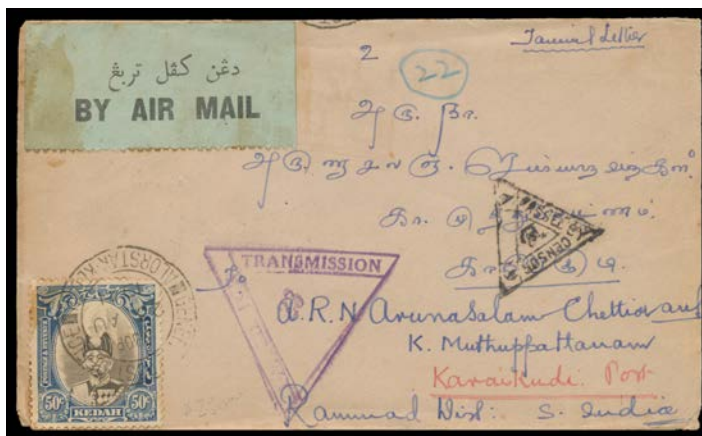
Ex Lot 1275