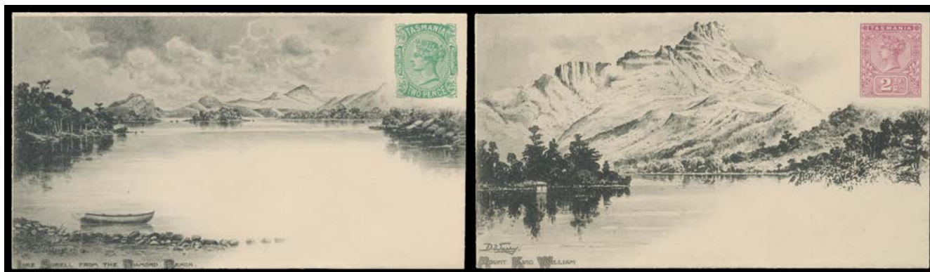
Ex Lot 1062