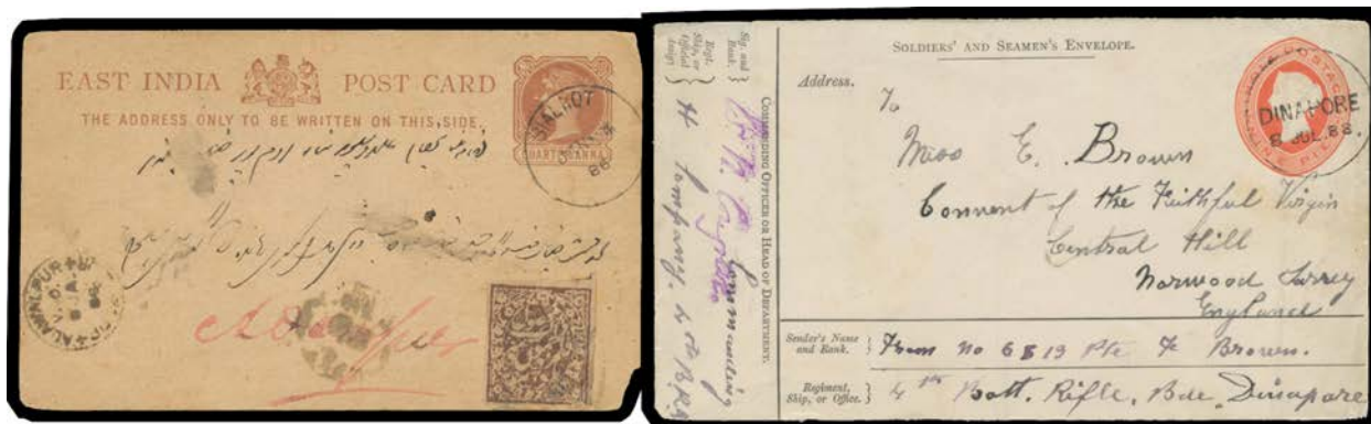
Ex Lot 1257