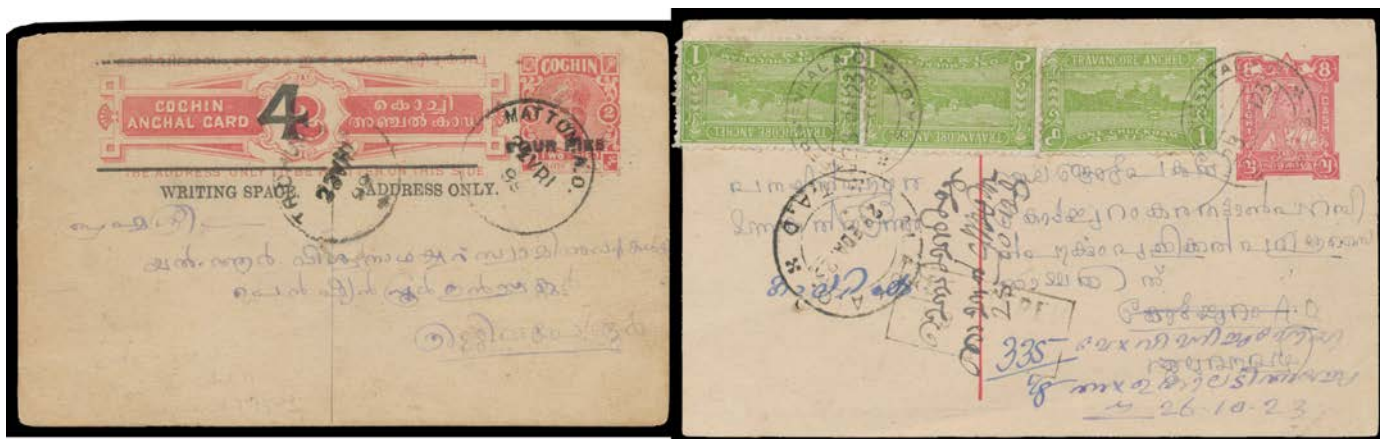
Ex Lot 1259