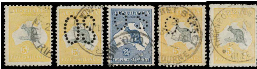
Ex Lot 541