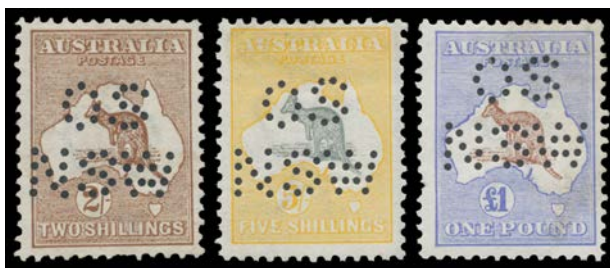
Ex Lot 569