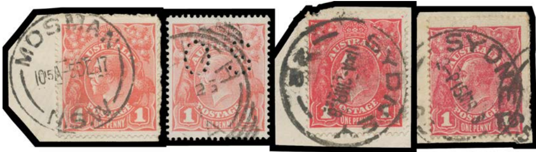
Ex Lot 601