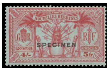
Ex Lot 1349

1349 * A B1 FRENCH: 1925 Dual Currency Arms 5c (½d) to 5fr (4/-) SG 42-52 plus the Postage Due set SG FD53-57 all with 'SPECIMEN' Overprint, Cat £500. (16)