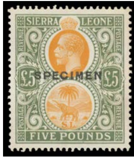
Ex Lot 1415

1415 * A- B1 1921-27 Script Definitives £2 blue & dull purple and £5 orange & green SG 147-8 both with 'SPECIMEN' Overprint, minor hinge remainders but very fresh, Cat £650. (2)