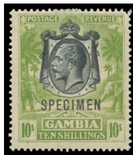
Ex Lot 1214