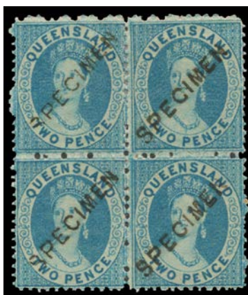
Ex Lot 933

933 Ω* A/B Selection of Small Chalons from various issues with values to 1/- grey x5 & 1/- violet x2 plus 2/- x2, 2/6d, 5/- x4 & 10/- including 2d scarce block of 4, all with various types of 'SPECIMEN' handstamp, minor duplication, many with part- to large-part o.g. & generally fine to very fine. (28)