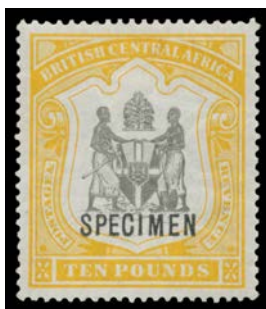
Ex Lot 1371

1371 * A/A- 1897-1900 Redrawn Arms 1d to £10 SG 43-52 plus 1901 New Colours 1d 4d & 6d SG 57d-58 all with 'SPECIMEN' Overprint, a few trivial blemishes, large-part o.g. & most are lightly mounted, Cat £815. (14)