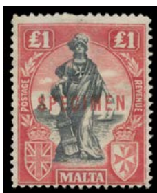
Ex Lot 1307

1307 * A- 1922-26 Definitives ¼d to £1 SG 123-39 - missing only the two 1926 low values - with 'SPECIMEN' Overprint, mostly minor hinge remainders, Cat £550 for the set of 17. (15)