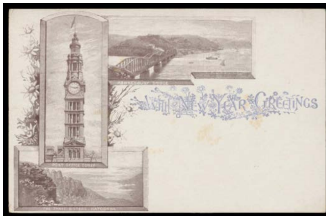
Ex Lot 928

928 PS A/B POSTAL CARDS: 1897 1d Die I group with "Greetings from", "With Christmas Greetings" x6 (one with Large 'SPECIMEN' Overprint on reverse) & "With New Year Greetings" x5 (one with Large 'SPECIMEN' Overprint on reverse), some minor blemishes - mostly on the address sides - but generally fine to very fine unused. (12)