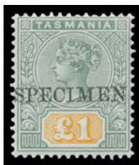
Ex Lot 1052

997 * A/B Various 'SPECIMEN' or 'Specimen' Overprints comprising Sidefaces ½d 3d & V/Crown 9d, Tablets 5d & 5/- and 1903 V/Crown 1/-, Pictorials 1899-1900 set of 8 and 1902 V/Crown set of 3, a few minor blemishes but generally very fine with large-part o.g. Ex VJ Colbeck. (17) 400