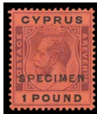
Ex Lot 1190