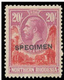
Ex Lot 1407

1407 * A B1 NORTHERN RHODESIA: 1925 KGV ½d to 20/- SG 1-17 complete with 'SPECIMEN' Overprint, lightly mounted, Cat £1200 including the 3/-, issued in 1929. (16)