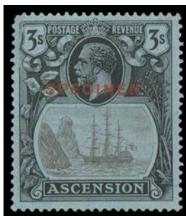
Ex Lot 1155

1154 * A/A- 1922 Overprints on St Helena ½d to 3/- SG 1-9 with 'SPECIMEN' Overprint, a few tiny defects, Cat £800. (9) 300