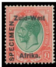
Ex Lot 1421

1421 * A/B 1923 Overprints on South Africa 14mm Setting ½d to £1 complete set of English singles SG 1-12 with 'SPECIMEN' Overprint, the 1/3d with concealed tear & the 5/- with minor bend, a few hinge remainders, Cat £1700 as singles. (12)