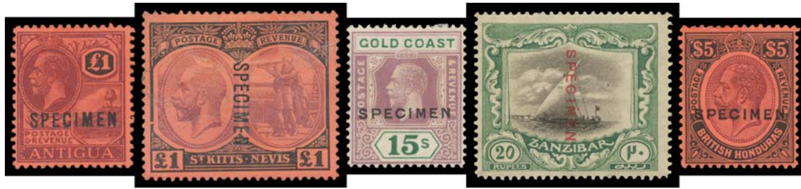
Ex Lot 514