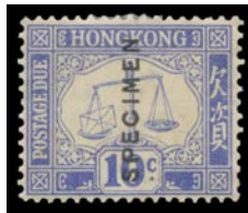
Ex Lot 1253

1253 * A B1 POSTAGE DUES: 1923 1c to 10c SG D1-5 complete with 'SPECIMEN' Overprint, Cat £425. (5) 300