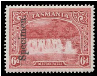
Ex Lot 997

997 * A/B Various 'SPECIMEN' or 'Specimen' Overprints comprising Sidefaces ½d 3d & V/Crown 9d, Tablets 5d & 5/- and 1903 V/Crown 1/-, Pictorials 1899-1900 set of 8 and 1902 V/Crown set of 3, a few minor blemishes but generally very fine with large-part o.g. Ex VJ Colbeck. (17) 400