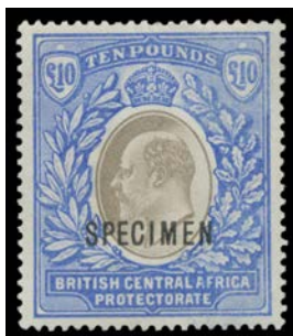
Ex Lot 1372

1372 * A/B 1903-04 KEVII 1d to £10 SG 59-67 all with 'SPECIMEN' Overprint, the £10 with slightly aged gum otherwise fine to very fine, most are lightly mounted, Cat £925. (10)