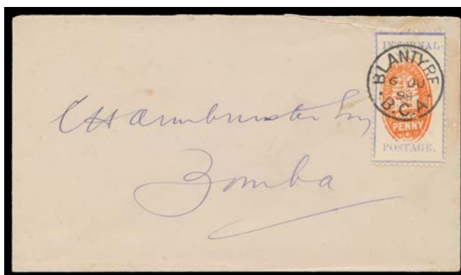
Ex Lot 1369

1369 *OCPS Selection with 1895 No Wmk Arms to 3/- with 'SPECIMEN' Overprint plus 2/6d to £1 with 'SPECIMEN' Handstamp, 1897-1900 Redrawn Arms used 3/- &amp; 4/-, 1898 'INTERNAL/POSTAGE' Imperf x3 &amp; Perf 12 x3 (one on 1898 cover from 'BLANTYRE' with 'ZOMBA' b/s), 1950 Postage Dues mint (VLMtd), a few condition issues, also BCA Postal Cards x4 &amp; Wrapper all with 'SPECIMEN' Overprint &amp; very fine. (38 + covers)