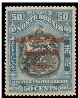
Ex Lot 1289

1289 * A-/B NORTH BORNEO: 1922 Malaya-Borneo Exhibition 1c to 50c SG 253-275 complete with 'SPECIMEN' Overprint, a small small defects & minor hinge remainders, Cat £475. (14)