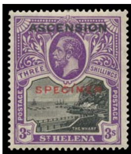
Ex Lot 1154

1154 * A/A- 1922 Overprints on St Helena ½d to 3/- SG 1-9 with 'SPECIMEN' Overprint, a few tiny defects, Cat £800. (9) 300