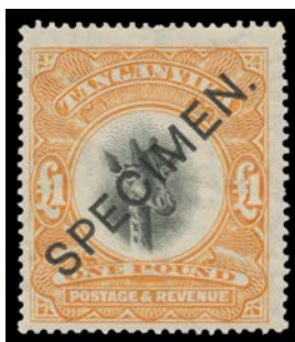
Ex Lot 1272

1272 *Ω A/A- TANGANYIKA: 1922-24 Giraffes 5c to £1 SG 74-88 complete with 'SPECIMEN' Overprint, some minor hinge remainders & the 10/- without gum but very fresh, Cat £800. (15)