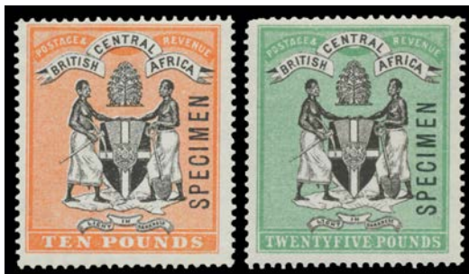
Ex Lot 1370

1370 ** A-/A+ 1896 Arms with Watermark 1d to £1 SG 32-40 plus the rare £10 & £25 (a few short perfs) SG 41 & 42 all with 'SPECIMEN' Overprint, full unmounted o.g. (!), Cat £1150 (mounted). Remarkably fresh & rarely available as a complete set, in any condition. (11)