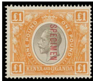
Ex Lot 1267

1267 * A-/B KENYA & UGANDA: 1922-27 KGV 1c to £1 SG 76-95 all with 'SPECIMEN' Overprint, the 10/- with small corner faults, some minor hinge remainders but very fresh, Cat £850 including five later values. (15) 400