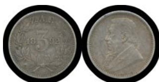
Ex Lot 248

247 - Z.A.R. 1898 Kruger 1d KM #2, aUnc. 150