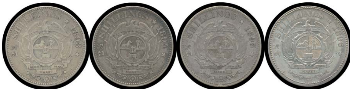
Ex Lot 293