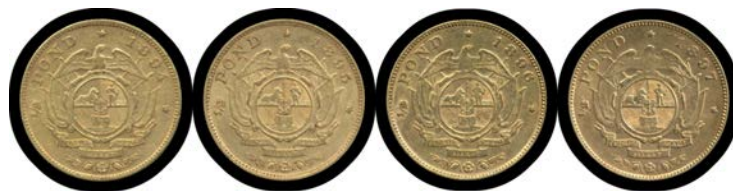
Ex Lot 305

305 HALF POND: Z.A.R. 1894-97 Kruger Gold Half-Pond, KM #9.2 condition varied. (4)