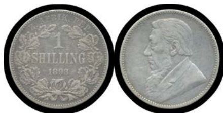
Ex Lot 266