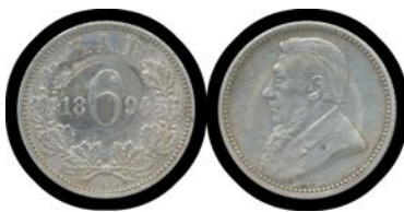
Ex Lot 260