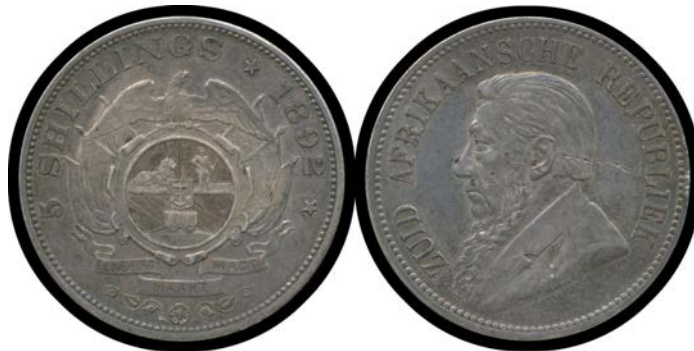
Ex Lot 299