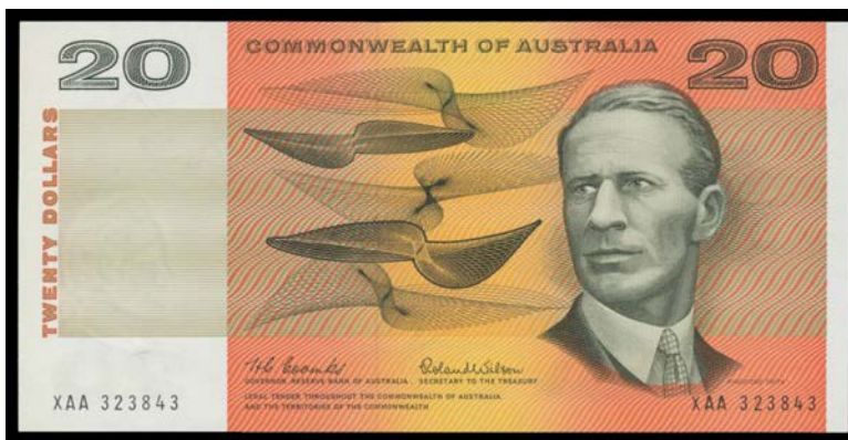
Ex Lot 204

203 - $10 1988 Polymer Bicentenary, Second Release Last Prefix, McDonald # 174b/2, 'AB57 801302', Uncirculated. Cat $2250. 250