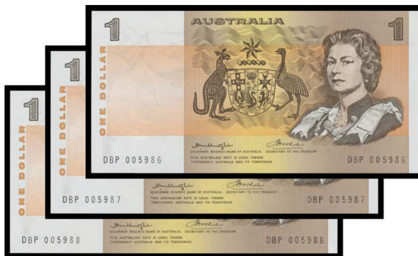
Ex Lot 194