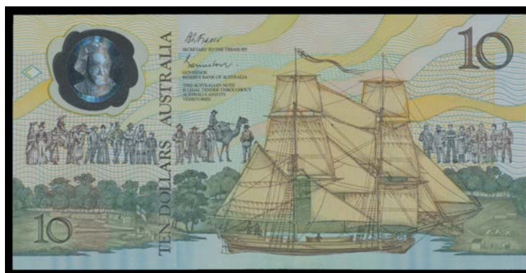
Ex Lot 201