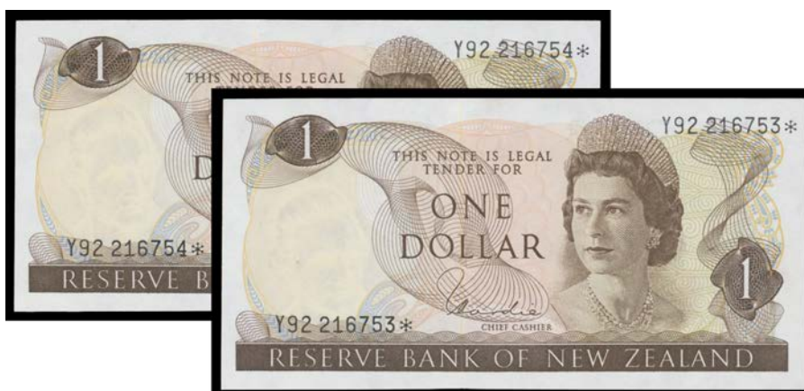
Ex Lot 339

338 - KGVI 1945 $10 "Short Snorter" Pick #13 red and multicoloured, portrait King George VI at right, nine ink pen autographs across front, provenance not checked by us, back; Malayan States Coats of Arms. [A Short Snorter is a banknote signed by people travelling together on an aircraft, originating with bush flyers in Alaska in the 1920s and spreading in popularity through the military and commercial aviation into the 1940s] 200