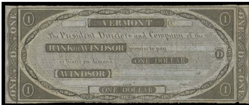
Ex Lot 340