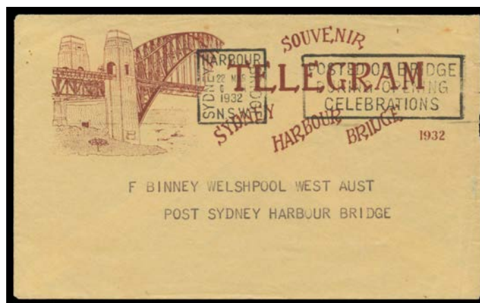
Ex Lot 334

334 C A ILLUSTRATED TELEGRAMS: Telegram with South-East Pylon cds of 21MR32, the matching envelope with Opening Celebrations slogan cancellation. (2 items)