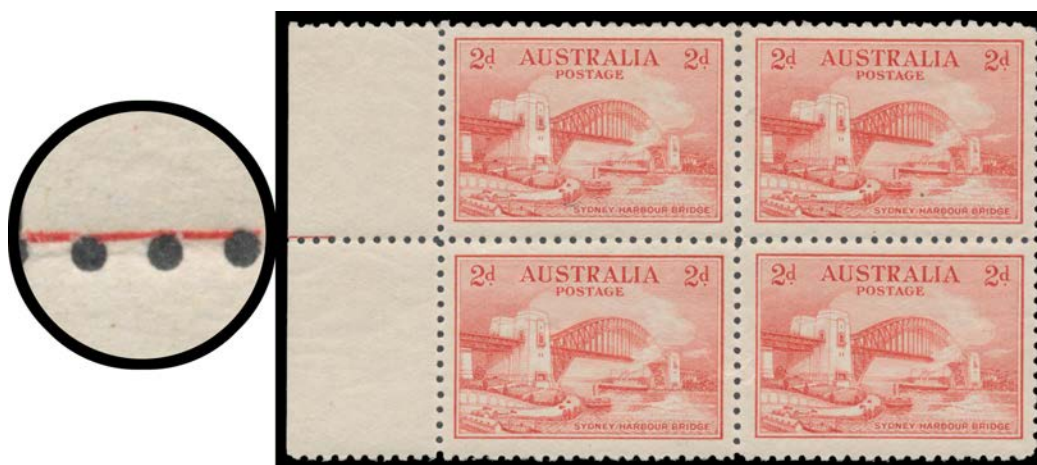
Ex Lot 324

324 * A PLATE DOTS: Recess 2d red two marginal blocks of 4 from the left of the sheets, the first with One Plate Dot BW #146z (Cat $400), the other with the horizontal line but the Plate Dot Omitted (unlisted), both very lightly mounted. (2 blocks)