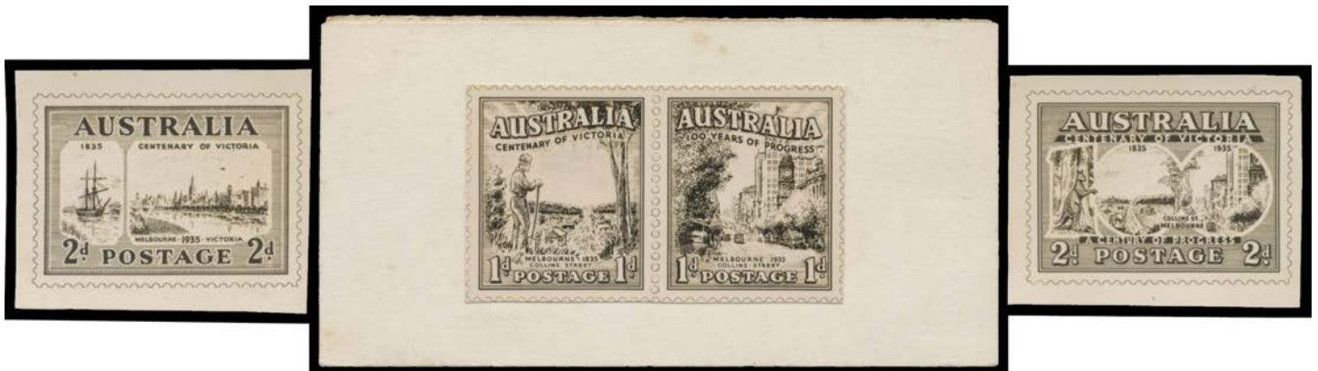
Ex Lot 338

338 E A CITY OF MELBOURNE DESIGN COMPETITION: Series of photographic reductions of seven designs - including two setenant pairs - submitted by James Berry from New Zealand, five of them affixed to three small pieces of card (each with the nom de plume 'ENDEAVOUR' on the reverse). [The competition was held too late to influence the stamp design. Berry was awarded a Bronze Medal] (7)