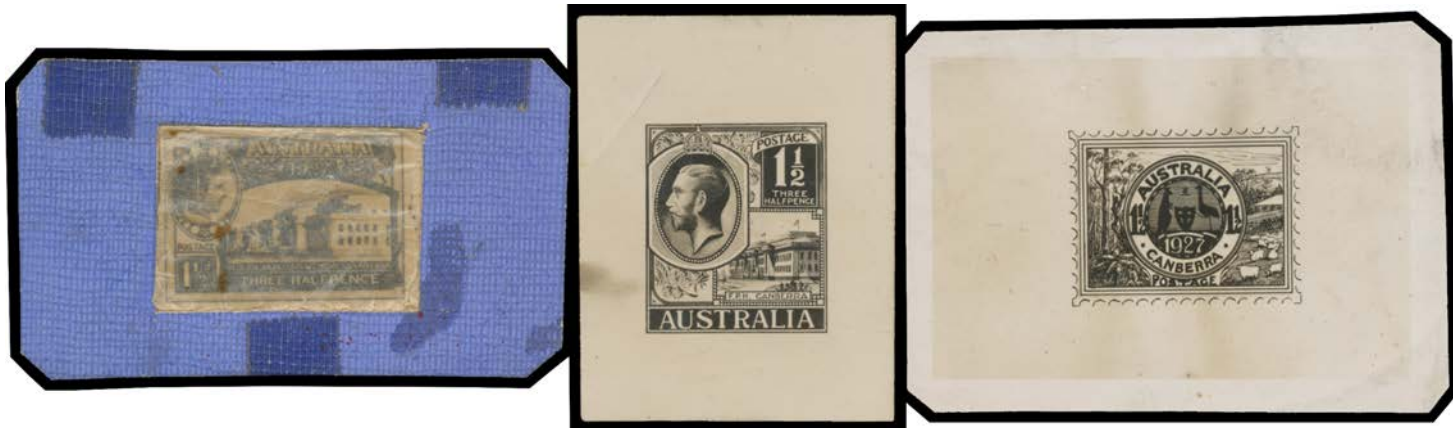
Ex Lot 289

289 E A STAMP DESIGN COMPETITION: Contemporary stamp-size photographic reductions of three entries including the Second-Prize Winner by "Tiger" ( JO Lyons ) plus a contemporary photographic enlargement of the "Tiger" entry & a colour photocopy of the original artwork (in the Australia Post Archives ), and three photographic enlargements - one may be contemporary - of three other entries including one by ET Luke . (7 items)