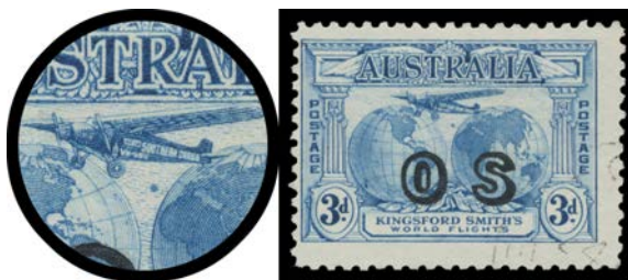
Ex Lot 316

316 **V A/A- OVERPRINTED 'OS': 2d & 3d x2 all unmounted, and CTO duo the 3d with Plane Dropping Mail Bag . No certificates so offered "as is" and unreserved. (5)