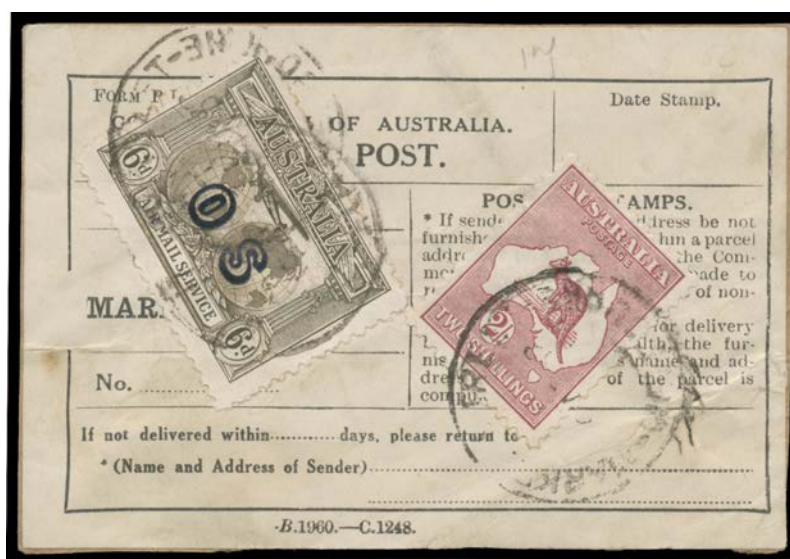
Ex Lot 320

320 C A/A- - Covers 1) 1931 airmail registered to London with 6d x3 (one without overprint) & numerous instructional handstamps; 2) 1932 airmail to King Island with 6d & KGV 2d; and 3) 1930s parcel label with 6d & Roos 2/- maroon (Third Wmk ?). Scarce trio. (3)