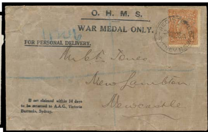
Ex Lot 34