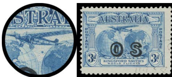
Ex Lot 316