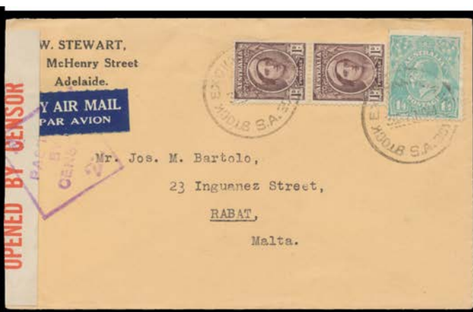
Ex Lot 35