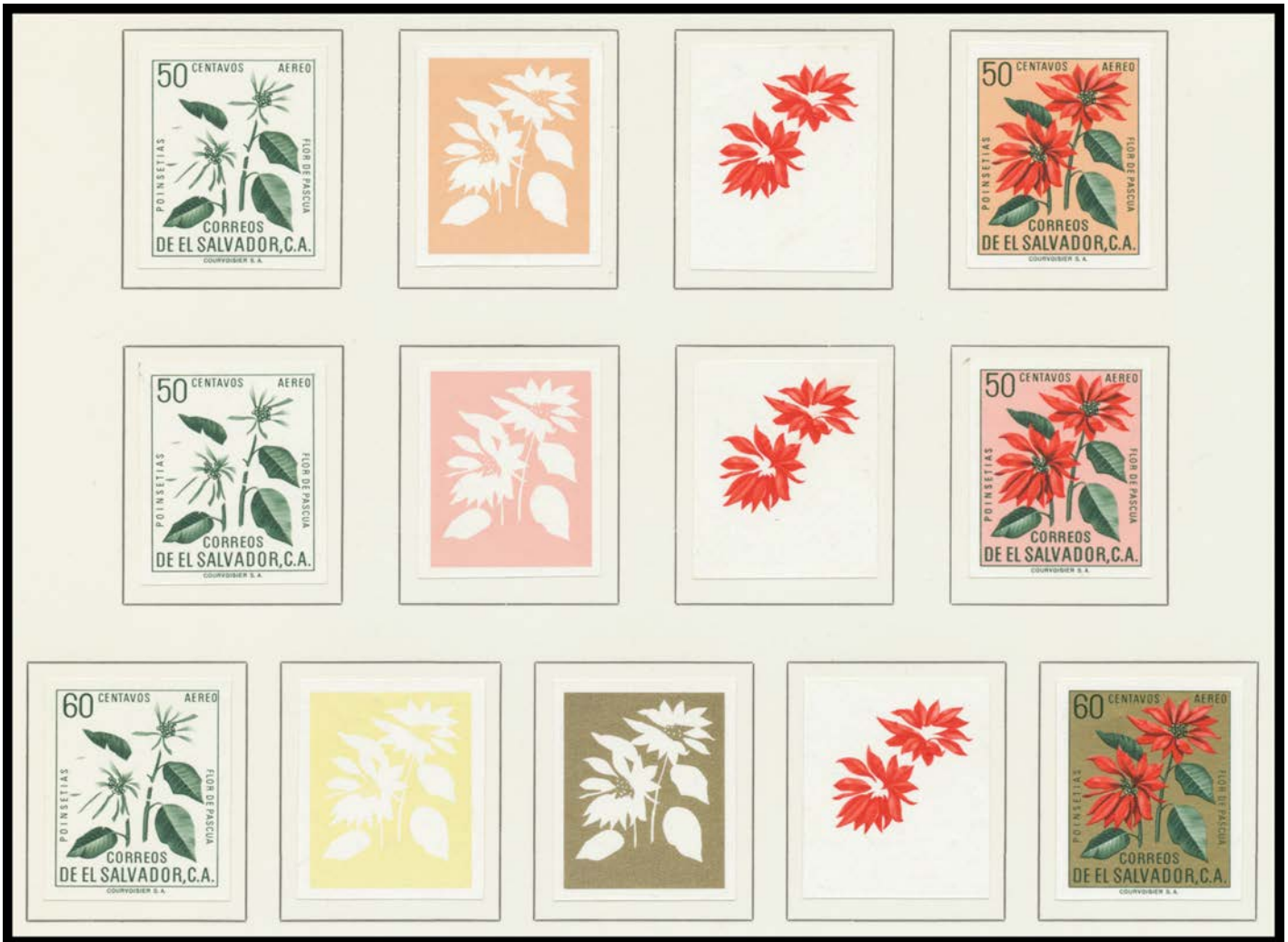
Ex Lot 907

907 P A EL SALVADOR: 1960 Christmas (Flowers) complete set of imperforate colour separations for the eight standard denominations plus the 40c & 60c that were issued only in miniature sheet format, affixed to eight pages from the printer's records. Ex Courvoisier Archives. (119 proofs)