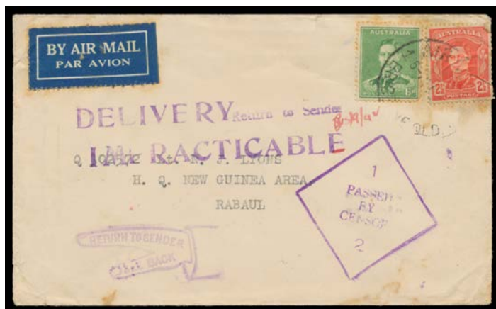
Ex Lot 263

262 C Wide-ranging annotated collection with many useful items including unit cachets, several hand-illustrated covers, 1942 with rubber 'MIL PO/ADELAIDE RIVER NT' cds, 1943 from a RAAF pilot in Canada with superb 'TRANSMISSION DELAYED/FOR PURPOSES OF SECURITY' h/s, 1942 (Jan 2) stampless from Singapore, 1942 (Jan) from NSW to 1st AGH then in Ceylon, 1943 & 1944 usages of 'POSTAGE/1d/PAID' Forces Letter Card from Papua to Victoria x2, 1945 (Sep) with 'AIR FORCE PO/No 73' cds used at Tarakan, good range of Naval items including 1944 commercial with blue/pink registration label (text excised), POW mail including 1941 (Mar) postcard from Hay Camp to London at 3/- rate with boxed 'PERMISSION/GRANTED' h/s, etc, also three Identity Cards & two different Myer food parcel labels both franked 5/10d, etc, condition variable. A good basis for serious expansion. (95) 1,000