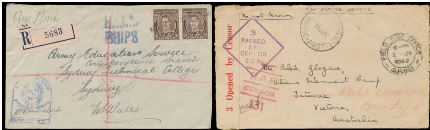
Ex Lot 262

262 C Wide-ranging annotated collection with many useful items including unit cachets, several hand-illustrated covers, 1942 with rubber 'MIL PO/ADELAIDE RIVER NT' cds, 1943 from a RAAF pilot in Canada with superb 'TRANSMISSION DELAYED/FOR PURPOSES OF SECURITY' h/s, 1942 (Jan 2) stampless from Singapore, 1942 (Jan) from NSW to 1st AGH then in Ceylon, 1943 & 1944 usages of 'POSTAGE/1d/PAID' Forces Letter Card from Papua to Victoria x2, 1945 (Sep) with 'AIR FORCE PO/No 73' cds used at Tarakan, good range of Naval items including 1944 commercial with blue/pink registration label (text excised), POW mail including 1941 (Mar) postcard from Hay Camp to London at 3/- rate with boxed 'PERMISSION/GRANTED' h/s, etc, also three Identity Cards & two different Myer food parcel labels both franked 5/10d, etc, condition variable. A good basis for serious expansion. (95) 1,000