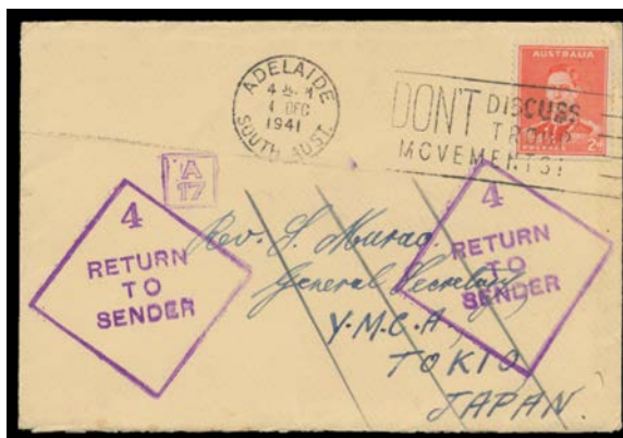
Ex Lot 264

263 C B 1941 (Sep 5) registered cover Melbourne-India with boxed 'RETURN TO SENDER/CONTENTS/ UNDELIVERABLE' h/s in violet; and 1942 (Sep) from Brisbane to an officer at Rabaul with 'DELIVERY/IMPRACTICABLE' & small 'Return to Sender' h/s both in violet; minor blemishes. Scarce duo. (2) 250