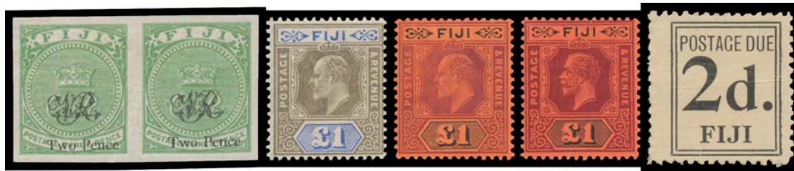
Ex Lot 589

589 */** Collection with a few earlies including 'VR' Underprints Laid Paper 'Two Pence' on 3d imperforate pair & QV 1/- x2, KEVII issues complete (the £1 SG 124 slightly rubbed), KGV Issues complete plus some shades (the £1 Die I is rubbed; the £1 Die II is unmounted & superb), KGV I Pictorials including Dies (the 10/- & £1 are unmounted), QEII 1954-59 3d to £1 (VLMtd or unmounted), 1959-2008 issues apparently complete including M/Ss unmounted, also Postage Dues 2d SG D3 (no gum, as issued), 1918 & 1940 sets, generally very fine, Cat £2500+. (100s) 1,000