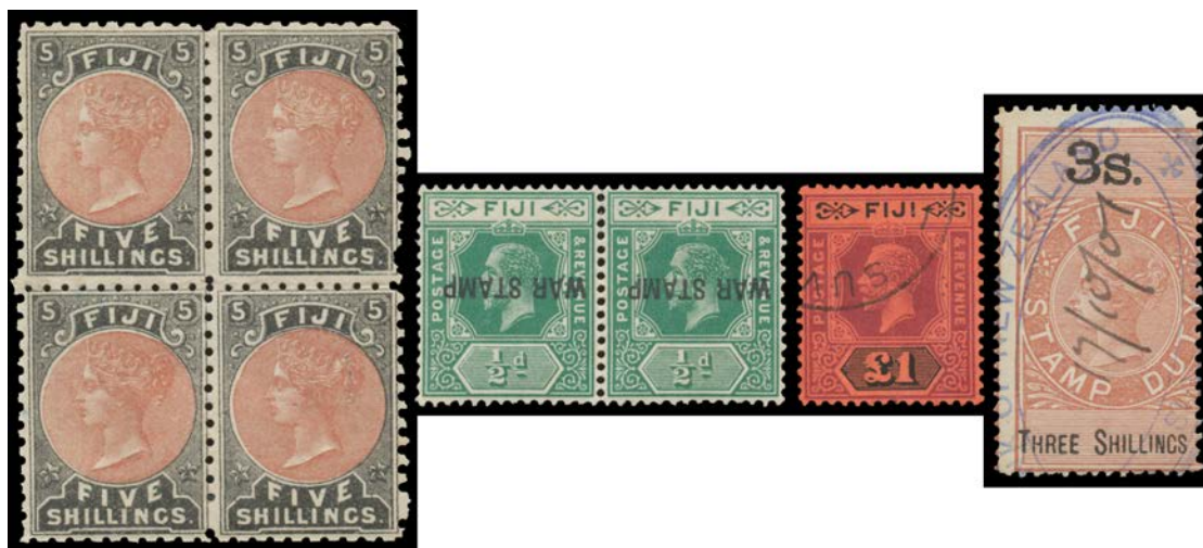
Ex Lot 590

589 */** Collection with a few earlies including 'VR' Underprints Laid Paper 'Two Pence' on 3d imperforate pair & QV 1/- x2, KEVII issues complete (the £1 SG 124 slightly rubbed), KGV Issues complete plus some shades (the £1 Die I is rubbed; the £1 Die II is unmounted & superb), KGV I Pictorials including Dies (the 10/- & £1 are unmounted), QEII 1954-59 3d to £1 (VLMtd or unmounted), 1959-2008 issues apparently complete including M/Ss unmounted, also Postage Dues 2d SG D3 (no gum, as issued), 1918 & 1940 sets, generally very fine, Cat £2500+. (100s) 1,000