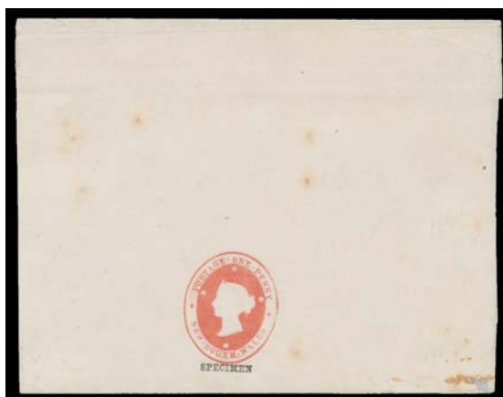
Ex Lot 363