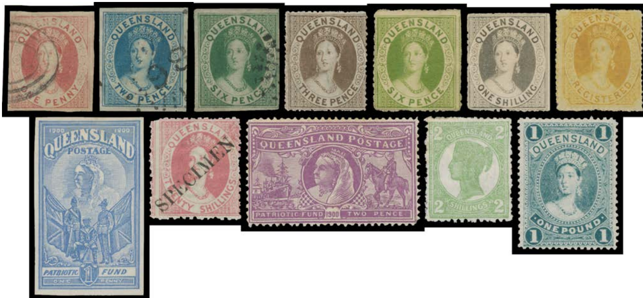
Ex Lot 368