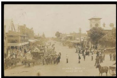
Ex Lot 1223

1223 C Collection on pages with a good range of Undivided Backs - probably more than we noted - including a few Jolleys & beautiful coloured types, some better suburban cards & a good Goulburn selection, Kerry Jenolan Caves x49 & many real photo types including "School Sports/Kempsey 08", etc, condition variable but many are fine to very fine used or unused. (250 approx)