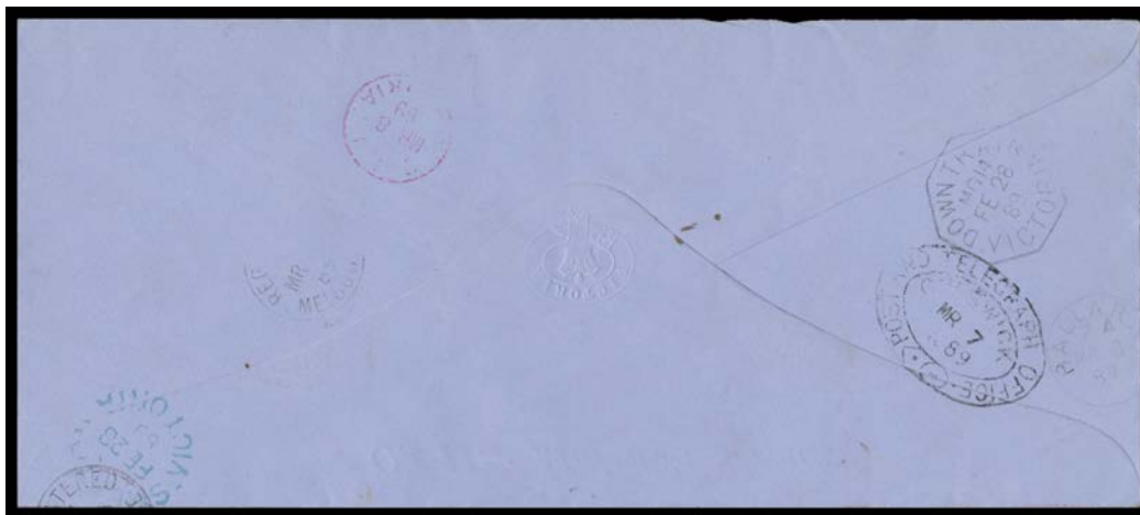
Ex Lot 381

381 CL A+ A2- - Type 2 (25mm Octagon) light but largely very fine b/s of FE28/89 on OHMS cover with 'ATTORNEY-GENERAL' Frank h/s & boxed 'REGISTERED' h/s both in rosine, to Smeaton with arrival b/s in blue, superb boxed 'UNCLAIMED' h/s in purple & returned with 'POST & TELEGRAPH OFFICE/CRESWICK' "belt & buckle" transit (the earlier of only two recorded examples) & light 'DLB' arrival b/s unusual in magenta; with the DLB 'RETURNED LETTER/REGISTERED' Envelope, both superb! Rated RRRR, being the earliest recorded of only 5 covers. (2 items)