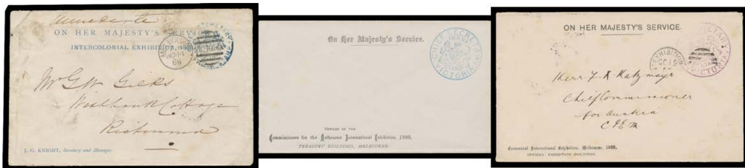
Ex Lot 208