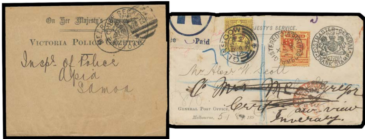
Ex Lot 185