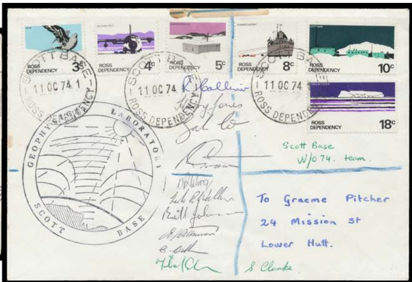
Ex Lot 1021