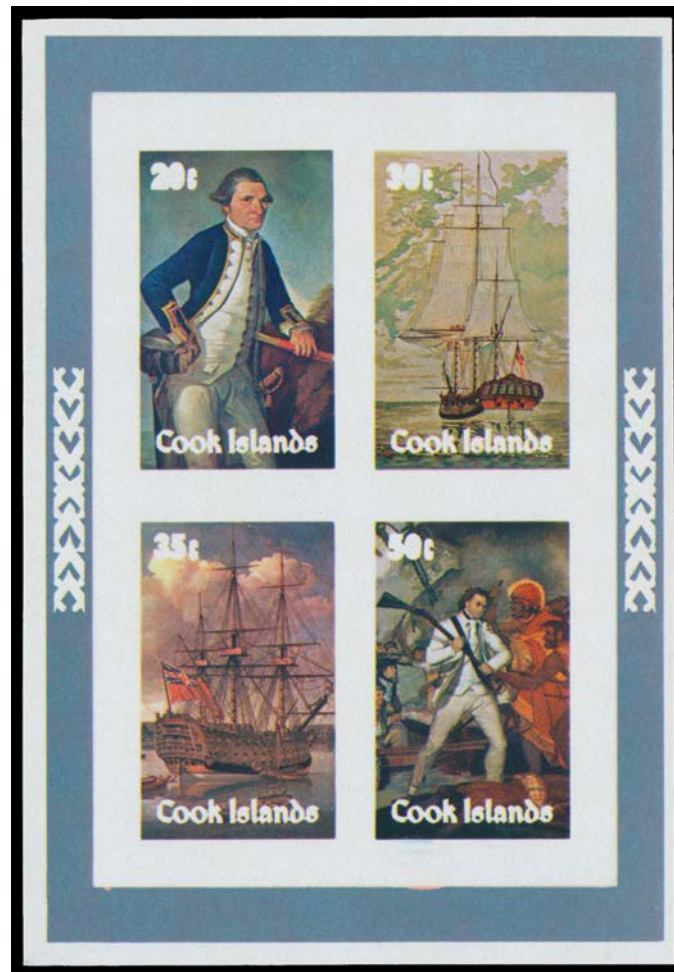
Ex Lot 1058