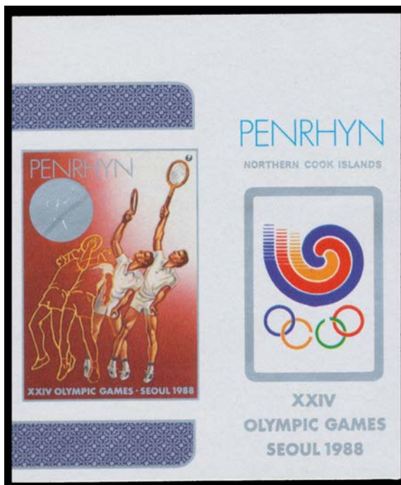
Ex Lot 1066