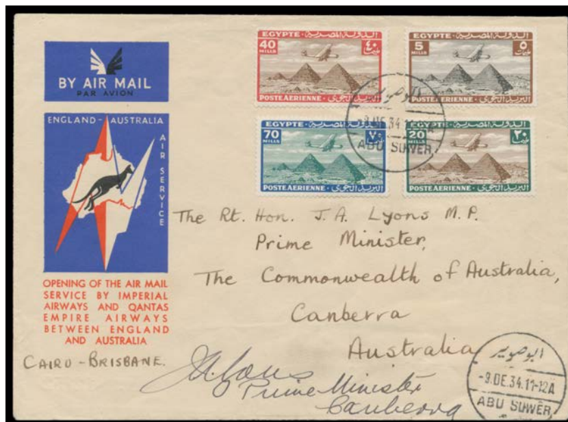
Ex Lot 327