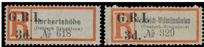
Ex Lot 1175

1174 */** 1914-15 6mm Spacing '1d.' on 5pf, '2½d.' on 10pf, '2½d.' on 20pf (unmounted) & '3d.' on 30pf SG 2 5 6 & 8, lightly mounted, Cat £750+. (4) 450 T