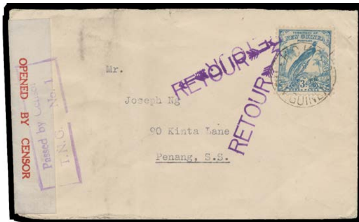
Ex Lot 1205