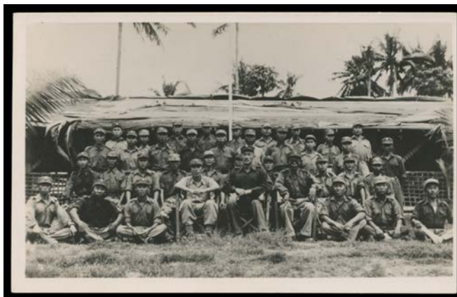
Ex Lot 1207