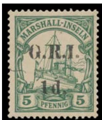
Ex Lot 1178

1177 *Ω A/B - Seriffed Town Name 'Kawieng/(Deutsch Neuguinea)' SG 42 Setting A [1, short perfs at left], [2], [4, short perfs at top] & [5, large-part o.g.] and Setting B [1], Cat £1250. (5) 500