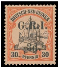
Ex Lot 1174

1173 * Deutsch Neu-Guinea 6mm Spacing '1d.' on 5pf with Short '1' SG 2b (a bit aged, Ceremuga Certificate ) & '2½d.' on 10pf (very fine, unmounted), 5mm Spacing '3d.' on 25pf x2 (one with hinge remainder; the other with a rounded corner) & '5d.' on 50pf (short perfs), Cat £1150. (5) 400