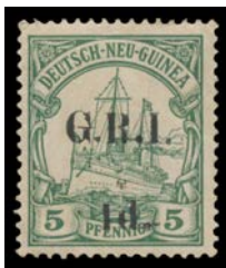
Ex Lot 1173

1173 * Deutsch Neu-Guinea 6mm Spacing '1d.' on 5pf with Short '1' SG 2b (a bit aged, Ceremuga Certificate ) & '2½d.' on 10pf (very fine, unmounted), 5mm Spacing '3d.' on 25pf x2 (one with hinge remainder; the other with a rounded corner) & '5d.' on 50pf (short perfs), Cat £1150. (5) 400