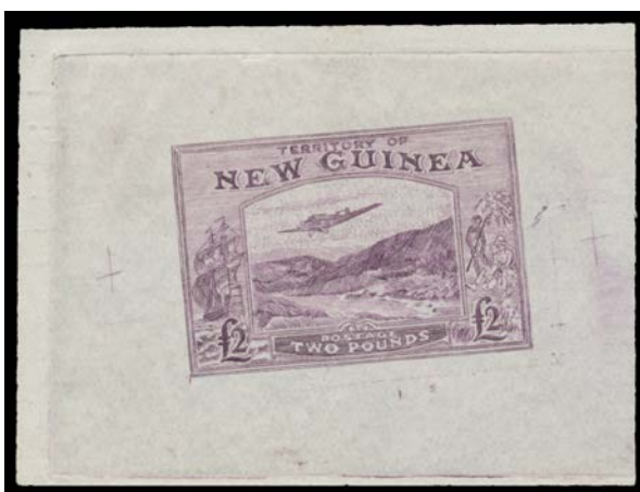
Ex Lot 1201