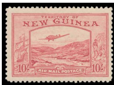
Ex Lot 1203