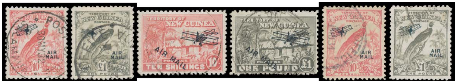
Ex Lot 1197

1197 O A/A- 1931-32 'AIR MAIL' Overprints Huts, Undated Bird & Dated Birds complete sets, mostly fine but a few lower values have minor problems, Cat £1275. (43)