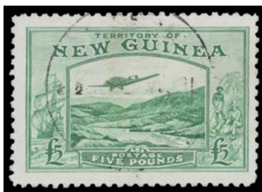
Ex Lot 1200