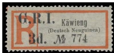
Ex Lot 1177

1176 *Ω - 'Manus/(Deutsch Neuguinea)' SG 39 Setting C [2, light crease, large-part o.g.], [3, faults], [4, a few short perfs, large-part o.g.] & [5, large-part o.g.], Cat £1300. (C) 450