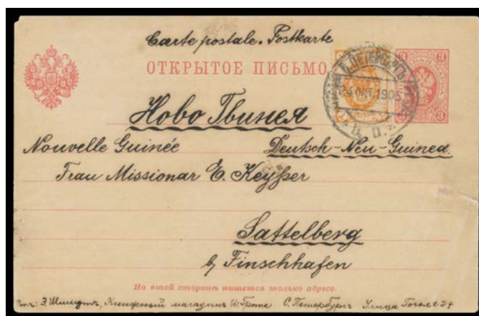
Ex Lot 1171