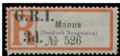
Ex Lot 1176

1175 Ω* 1915 'G.R.I./3d.' on German Registration Labels selection comprising 'Rabaul/(Deutsch Neuguinea)' SG 33 x3, 'Herbertshöhe/(Deutsch Neuguinea)' SG 36, 'Manus/(Deutsch Neuguinea)' SG 39, Seriffed Town Name 'Friedrich-Wilhelmshafen/(Deutsch-Neuguinea)' SG 41 & 'Kawieng/(Deutsch Neuguinea)' SG 42 x7, condition rather mixed, a few with part-o.g., Cat £3400+. Unusual opportunity. (13) 1,000