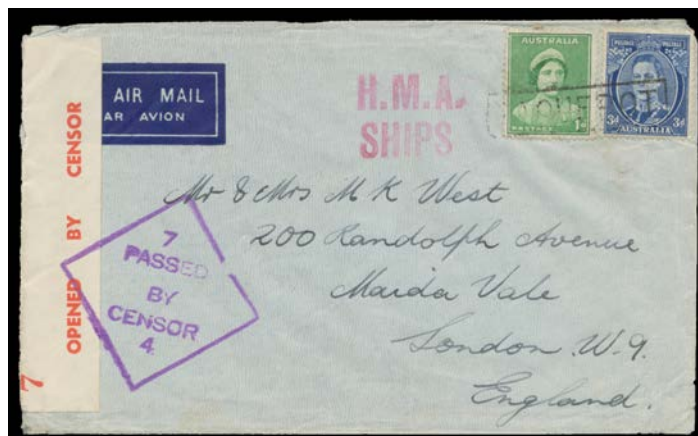
Ex Lot 447