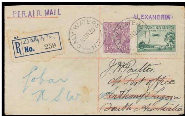
Ex Lot 315