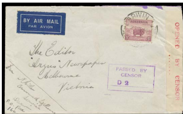
Ex Lot 388

388 CPS A/B 1939-45 World War II Civilian Censorship modest exhibit with good range of labels and cachets arranged by district including Tasmania x8 and Northern Territory x5, noted 1941 Brisbane label used with Townsville '1/2' cachet & 1945 red-on-yellow label on KGVI 7d 'AIR LETTER', 1942 Sydney blank white label, Newcastle nine-dot labels with altered Sydney cachets x2, Hobart boxed 'PASSED BY CENSOR' in red with KGVI 2d tied 'LINDISFARNE/24OC39/TAS-AUST' cds, Launceston '6/1' label in black unusually on 1941 cover from Ceylon to Tattersalls , Darwin 7-dot label & boxed 'D2' cachet on 1940 airmail cover plus diamond '7' cachets on 1942 covers from Tennant Creek x2 and on 1943 military mail, mixture of domestic and overseas mail with destinations including British Guiana, Ceylon & Ireland and a few other inwards items, a couple with minor blemishes but overall fine. (100+)