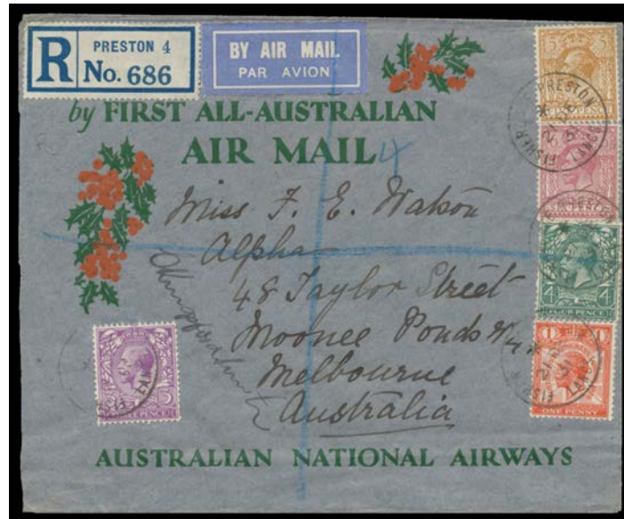
Ex Lot 316