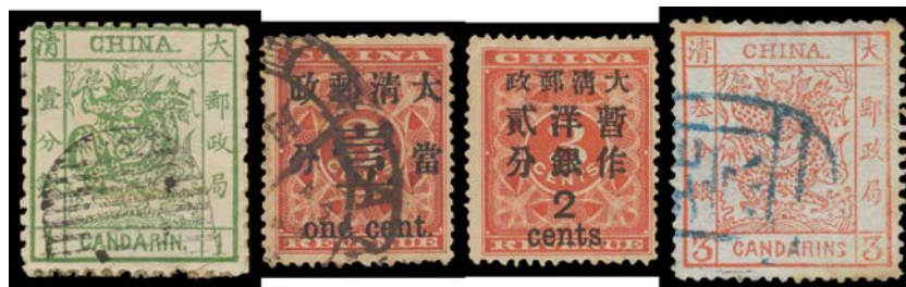
Ex Lot 1043