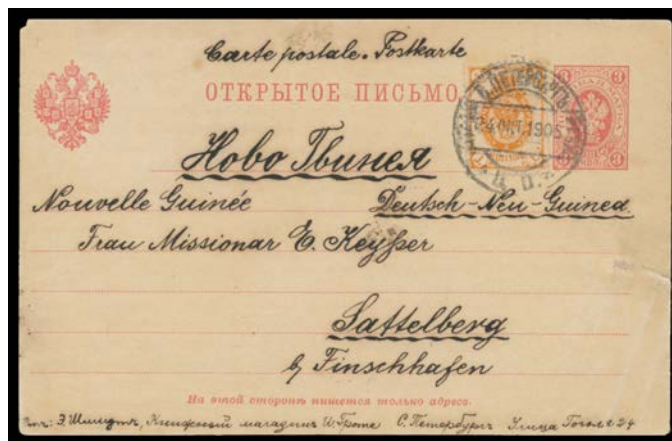
Ex Lot 1171

1171 CPS INWARDS MAIL: 1890 Bavarian 10pf Postal Card to Stephansort, 1897 triple-rate cover from NSW, 1905 uprated Russian Postal Card to "Sattelberg/bei Finschhafen", 1906 re-use of German 2pf+3pf Postal Card with 5pf Yacht added, 1908 uprated Austrian Postal Card, 1910 PPC from Japan, and three others, condition variable. (9) 600