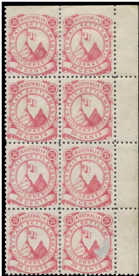
Ex Lot 718