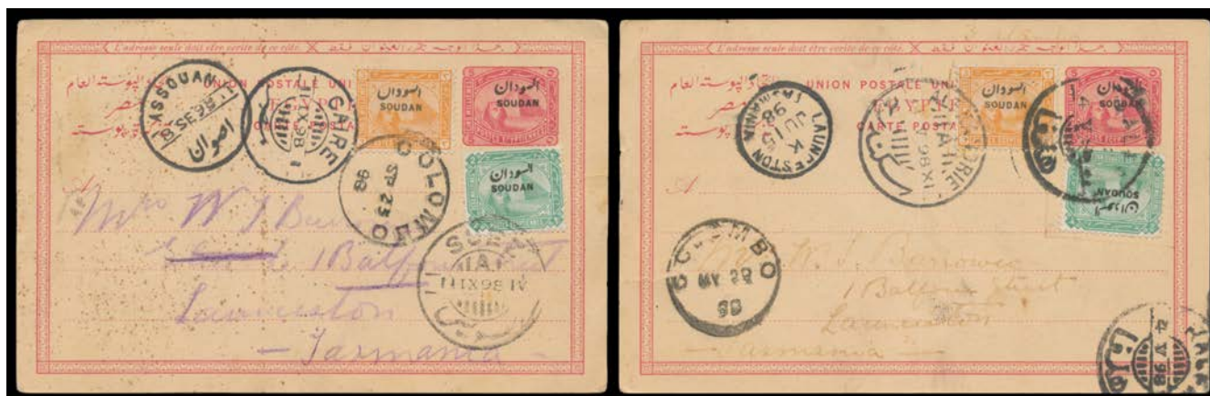
Ex Lot 1320

1319 **/OPS 1897 'SOUDAN' Overprints on Egypt study on leaves with basic sets mint x2 & used plus the six types of the overprint for all values - missing only the 5pi Type IV - mostly used but 10pi x4 are mint, plus plating guide, Postage Dues, 5m with 'SG' perfin Inverted & Reversed used, 'TEL'-in-Oval (= Telegraphs) handstamp x6, generally fine, plus 1905 'ARMY' Reading Up 1m SG A1 block of 10 [5-6/29-30], the second & fourth units with Small Overprint resulting in two se-tenant pairs SG A1c, the second-last unit with '!' for 'I' SG A1a, well centred, Cat £1400++; also Postal Stationery in very mixed condition. (150+) 400